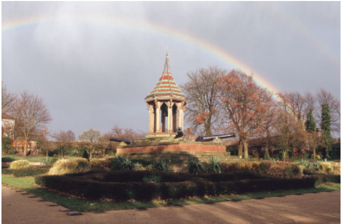
Chinese Bell Tower, Arboretum.