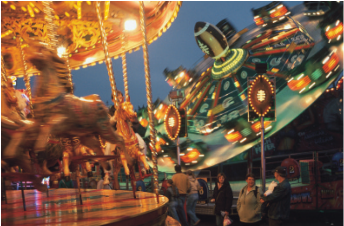
Above: The Goose Fair, the Forest Recreation Ground, held each year in early October.