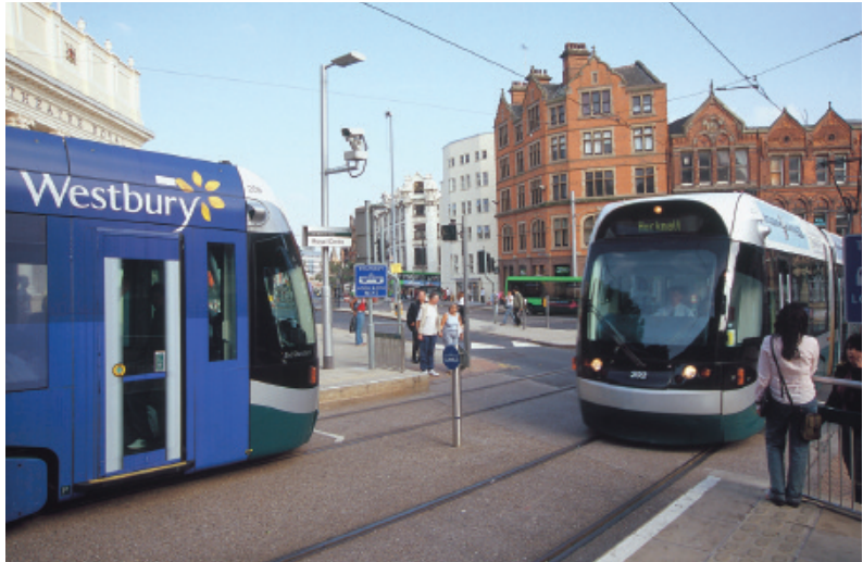
Theatre Square is one of the dropping-off points for the tram system that enters the city from the north.