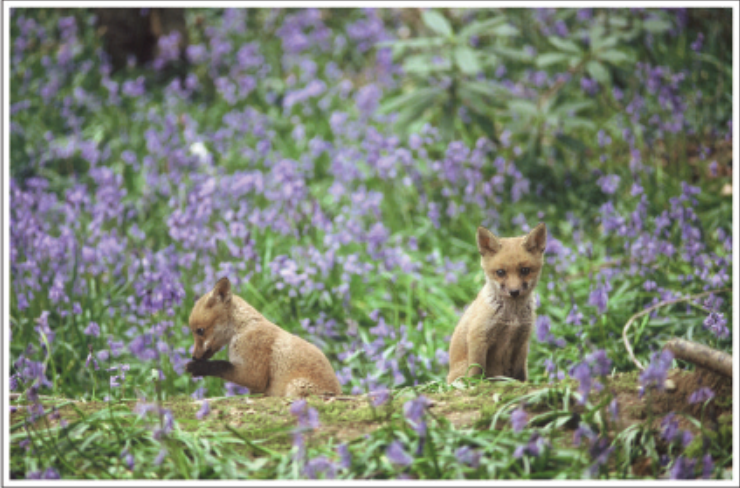
We like to keep clean too.