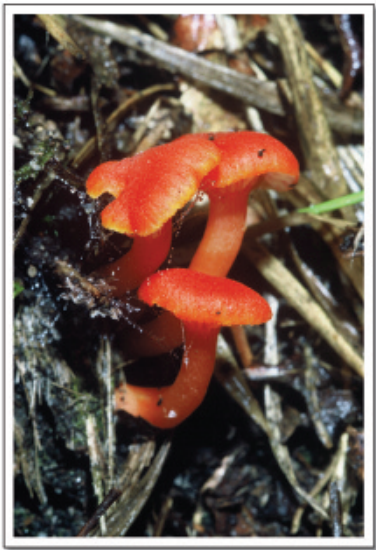
Hygrocybe miniata fungus.