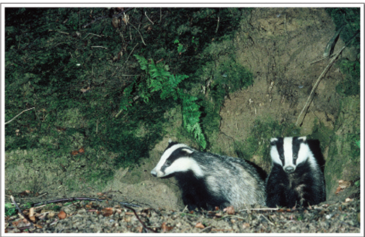
Is it safe to emerge?