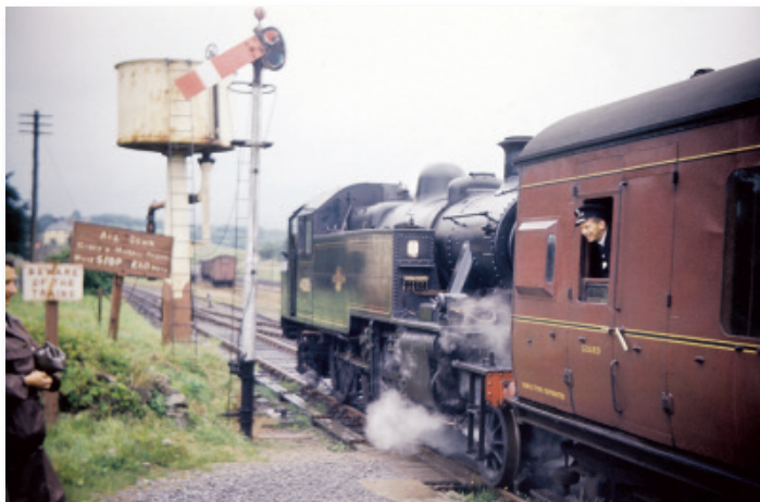
No 41283 has arrived at Lydford station, which was shared by the SR and GWR. 5 September 1965.