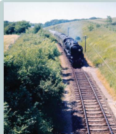
Top right: Merchant Navy Class Pacific No 35003 Royal Mail was in light steam. 10 June 1967.