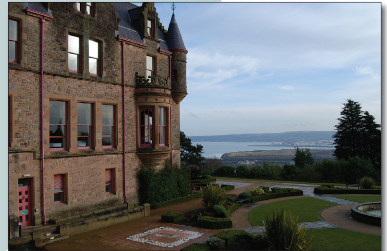
Looking down to the lough – from the grounds of Belfast Castle on Cave Hill.