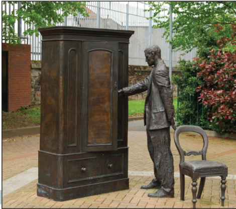
C.S. Lewis – born in Belfast, this statue was erected in 1998 to celebrate the centenary of his birth.