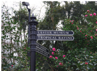
Signpost in Botanic Gardens.