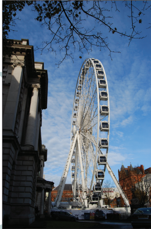
The Belfast Eye.