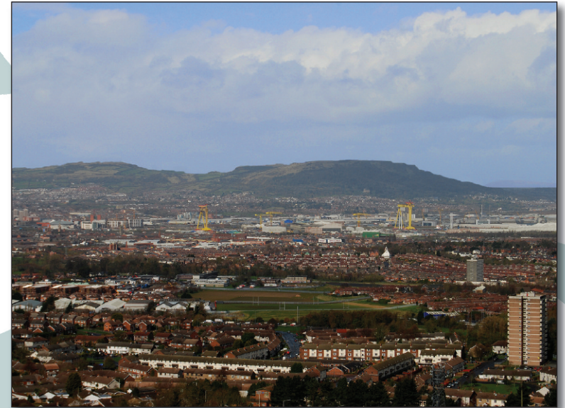
City in a bowl – from the North Down hills on one side to the view of Cave Hill in the distance with the city sprawling in between.