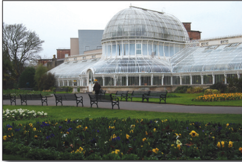
The Palm House at Botanic Gardens.