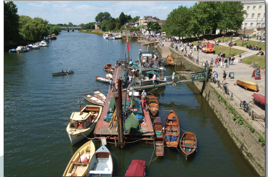
A classic Richmond Riverside view from the bridge looking downriver.