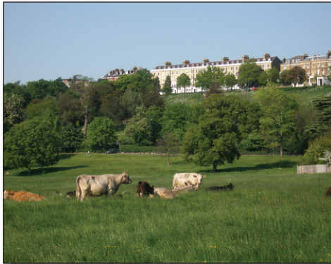
Cows graze on Petersham Meadow during the summer and go to winter quarters in late October.