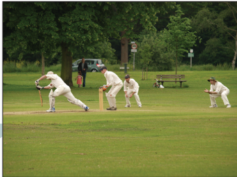
Ham Cricket Club plays on Ham Common and has a long tradition as a village cricket club, since 1815.