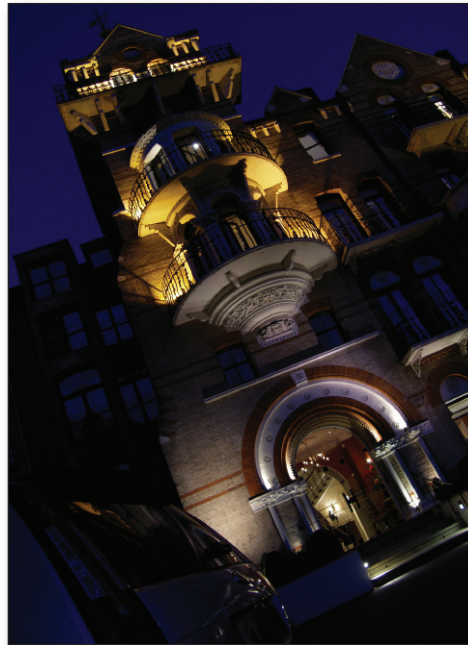
The magnificent late-Victorian Petersham Hotel (on the border of Richmond and Petersham) opposite Petersham Meadow.