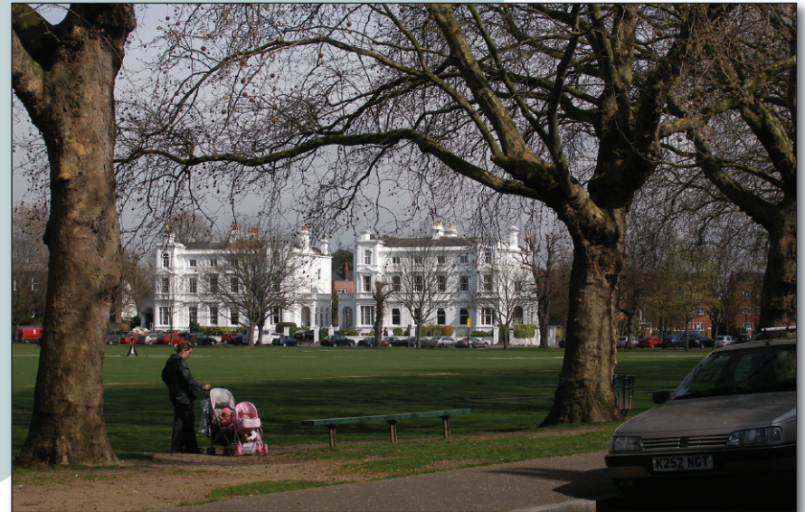
Looking across to the north side of The Green.