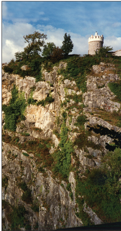
Avon Gorge and Camera Obscura.