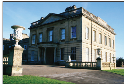
Blaise Castle Museum.