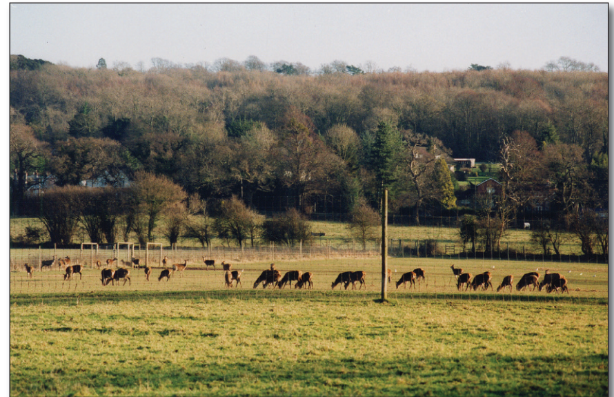
Deer farm at Chelvey Batch.