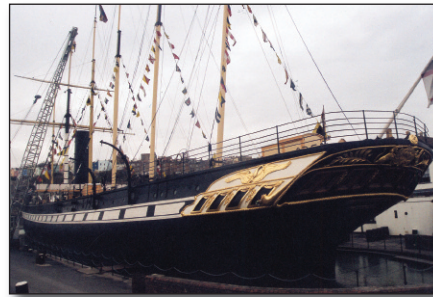
SS Great Britain.