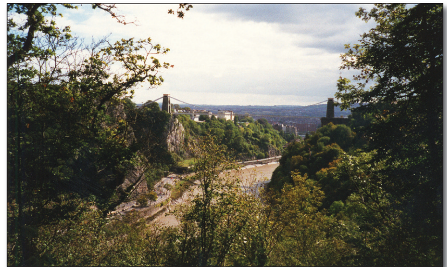
Glimpse of Clifton Suspension Bridge.