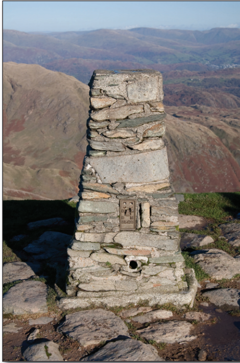
O.S. column on summit of Old Man