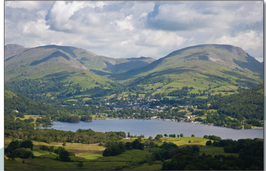
Windermere and the Fairfield Horseshoe from Latterbarrow