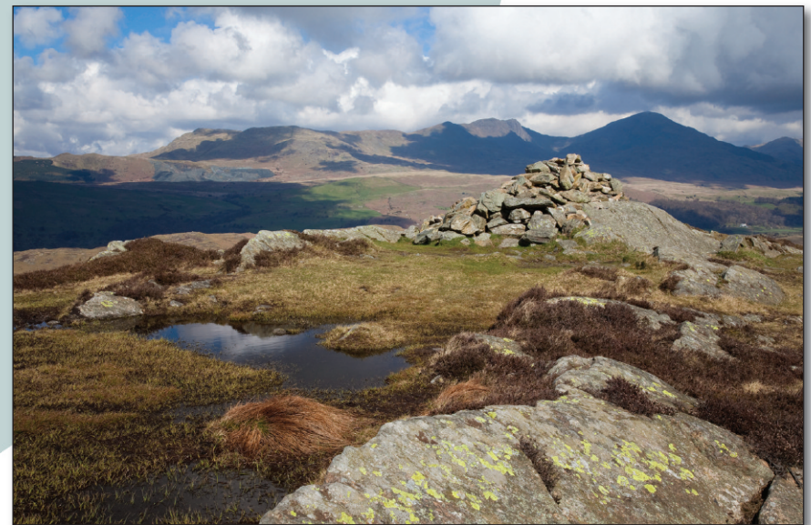
Coniston Fells from summit of Beacon Fell