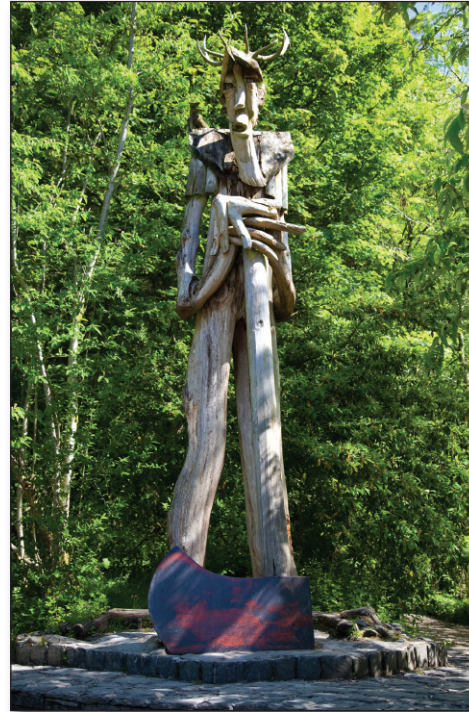
The Ancient Forester at Grizedale Visitor Centre