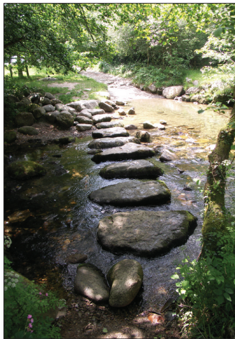
Stepping stones across the River Meavy