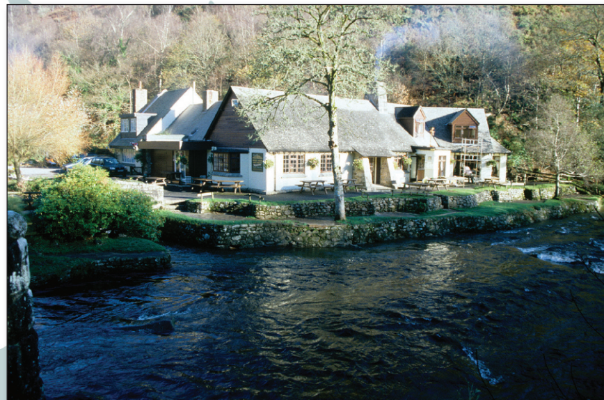
The Angler's Rest on the River Teign