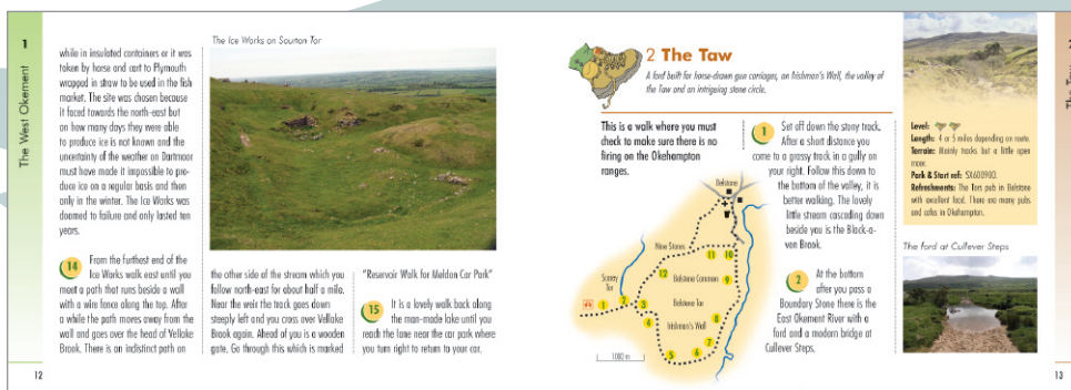
Example of a double-page spread.