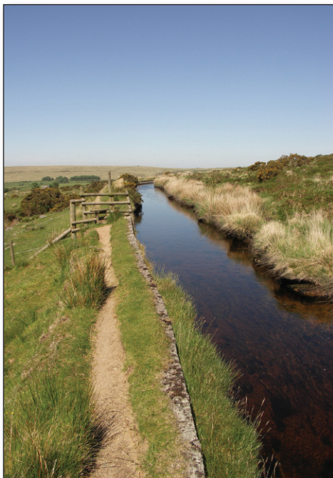
Wheal Jewel leat at the start of the River Tavy walk