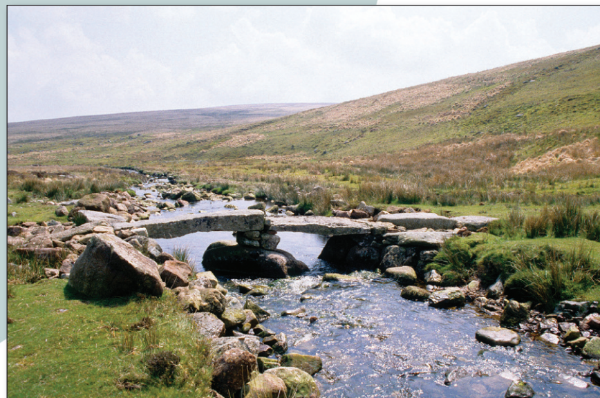
An old clapper bridge just up the Avon from Huntingdon Cross