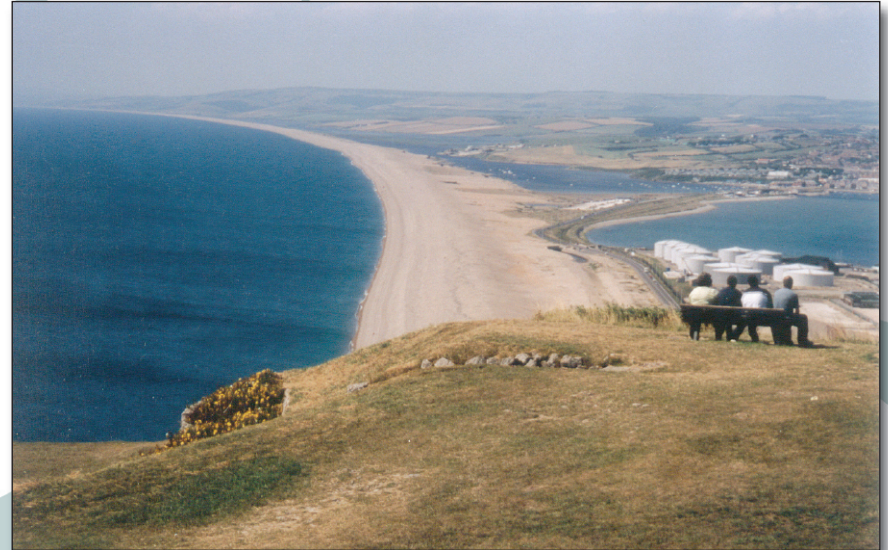
Chesil Beach view