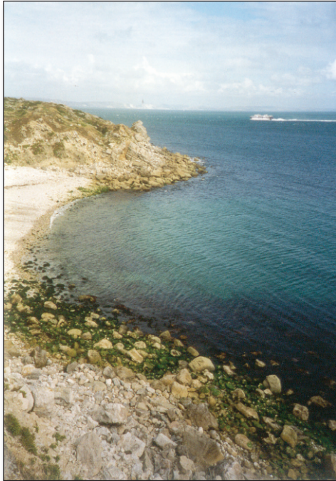
Church Ope Cove