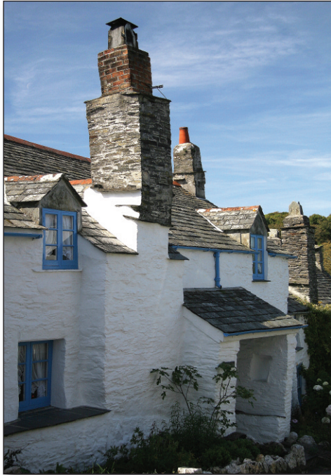
Boscastle Old Village