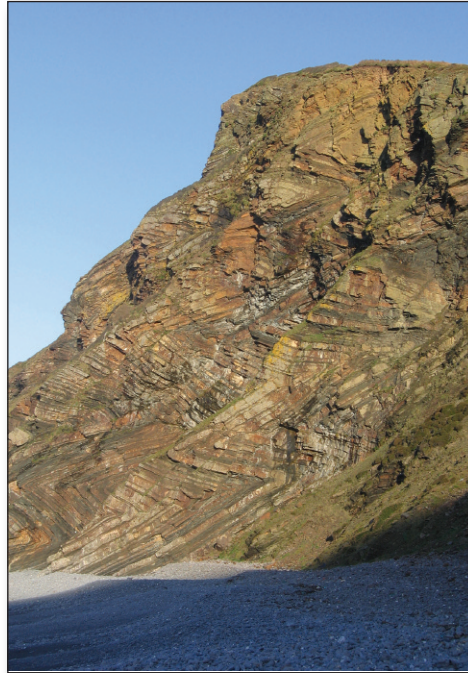
Cliffs at Millook