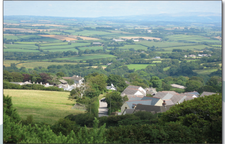
View from Warbstow Bury