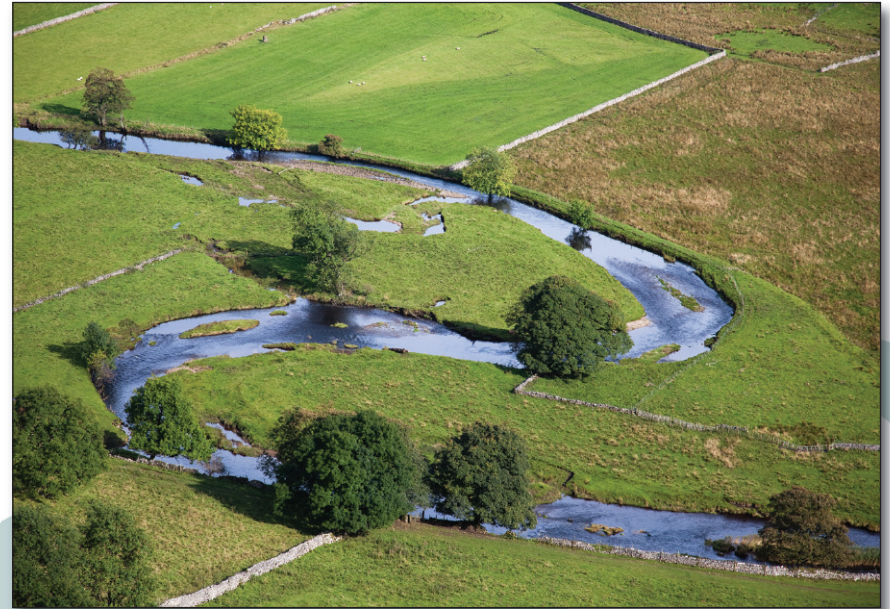
The Wharfe meanders along the valley