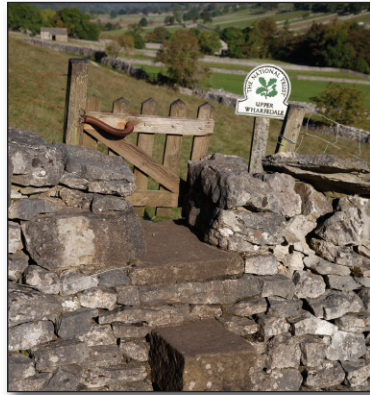
"Through the wall stile"