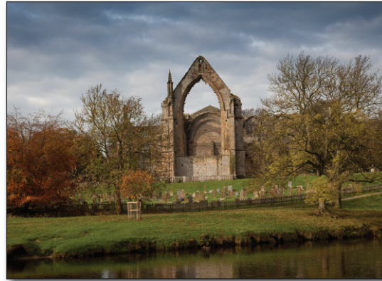
The ruins of Bolton Abbey