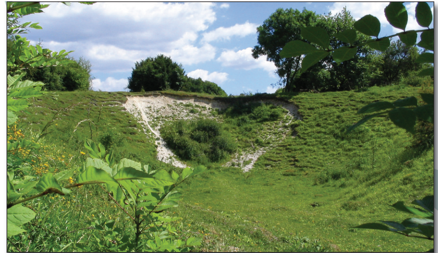
Grassed-over chalk pit on Noar Hill