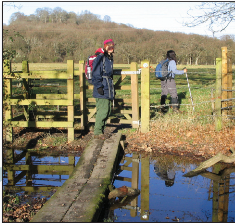
Footbridge near St John's Hill