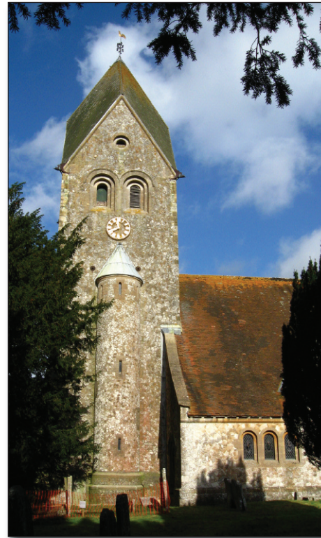
The Rhenish Helm bell tower of Hawkey church