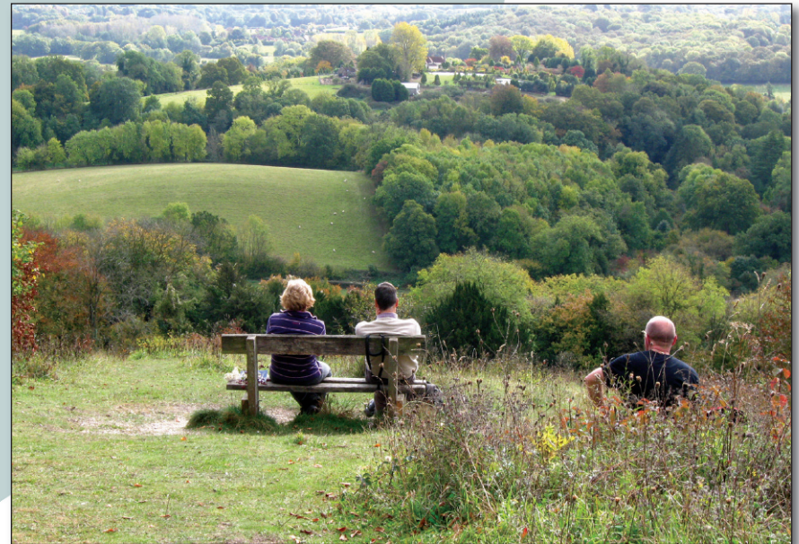
Admiring the view from the Shoulder of Mutton Hill