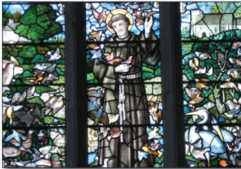
Detail from St Francis window in Selborne church