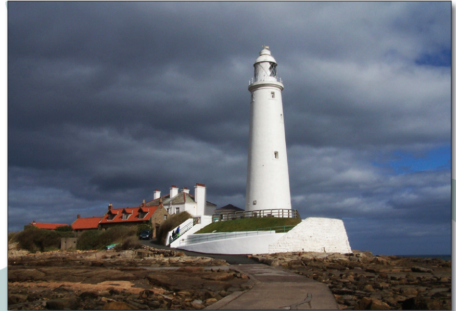
St Mary's Island from causeway