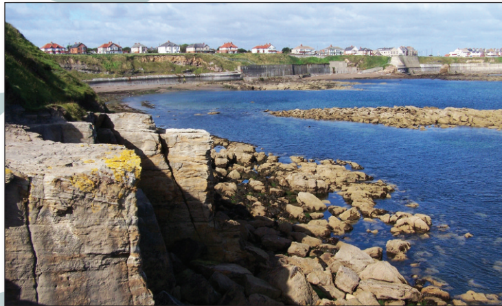
Right: Crag Point and Old Hartley