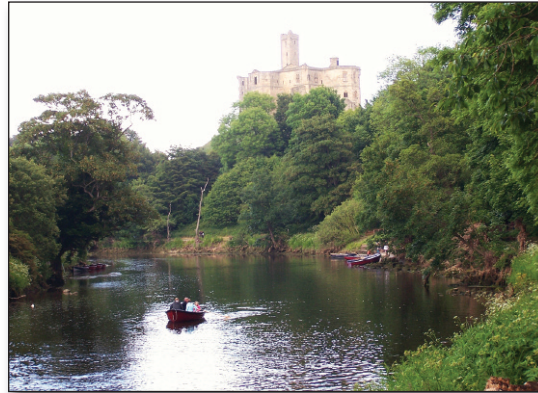
River Coquet and Warkworth Castle