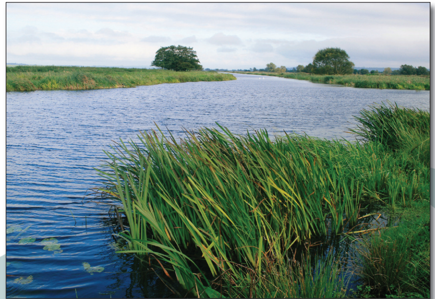
King's Sedgemoor Drain