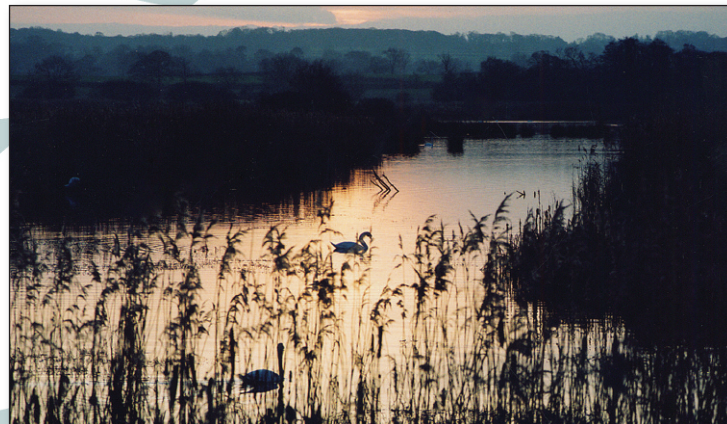
Right: Shapwick Heath Nature Reserve