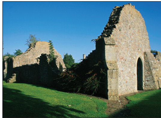
Chapel of St Columbanus