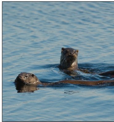
Otters at Westhay