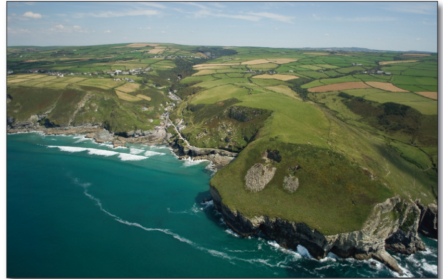
Looking inland over Trebarwith Strand.