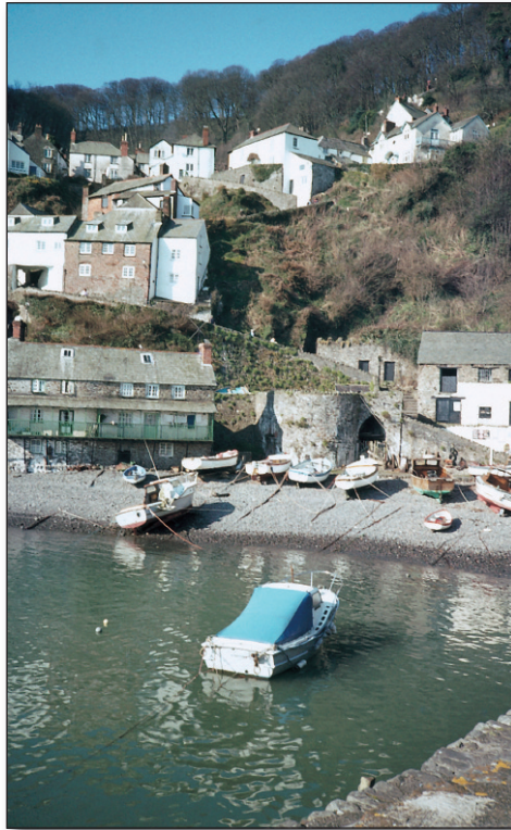
Clovelly, a village like a waterfall.