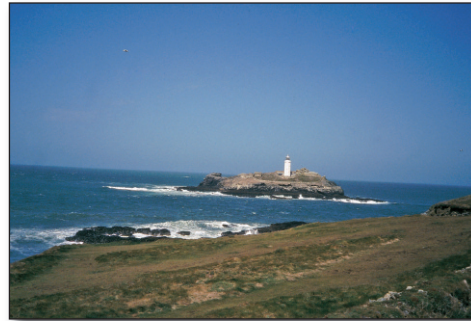
Godrevy Island and lighthouse.