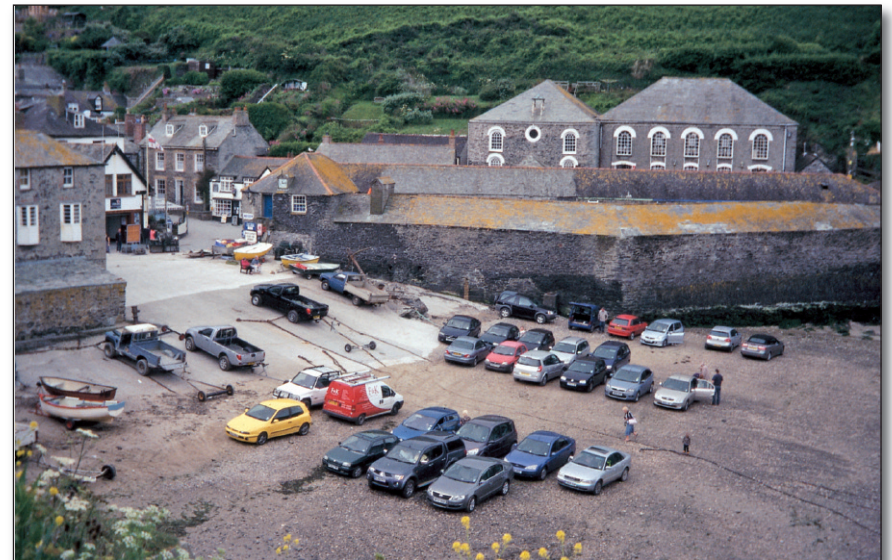
Beach parking, Port Isaac.