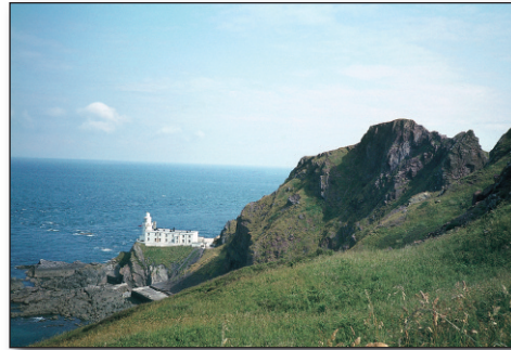
Hartland Point Lighthouse.