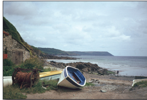
The Dodman from West Portholland.