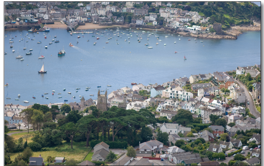
The view across Fowey towards Polruan.