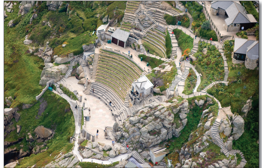
Aerial view of the Minack Theatre.