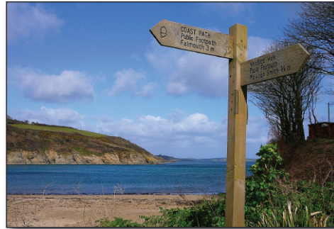
South West Coast footpath sign at Maenporth.