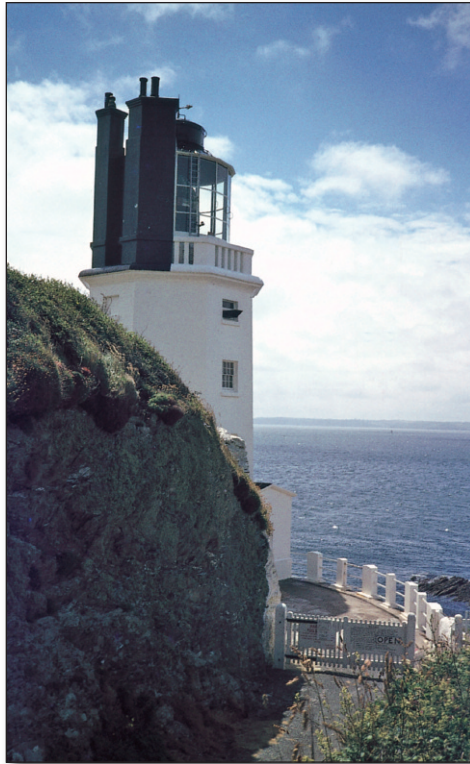
St Anthony's Lighthouse.