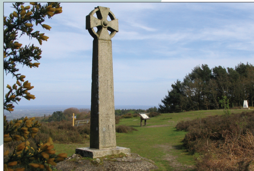
Celtic cross on Gibbett Hill