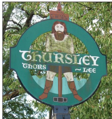
Thursley village sign