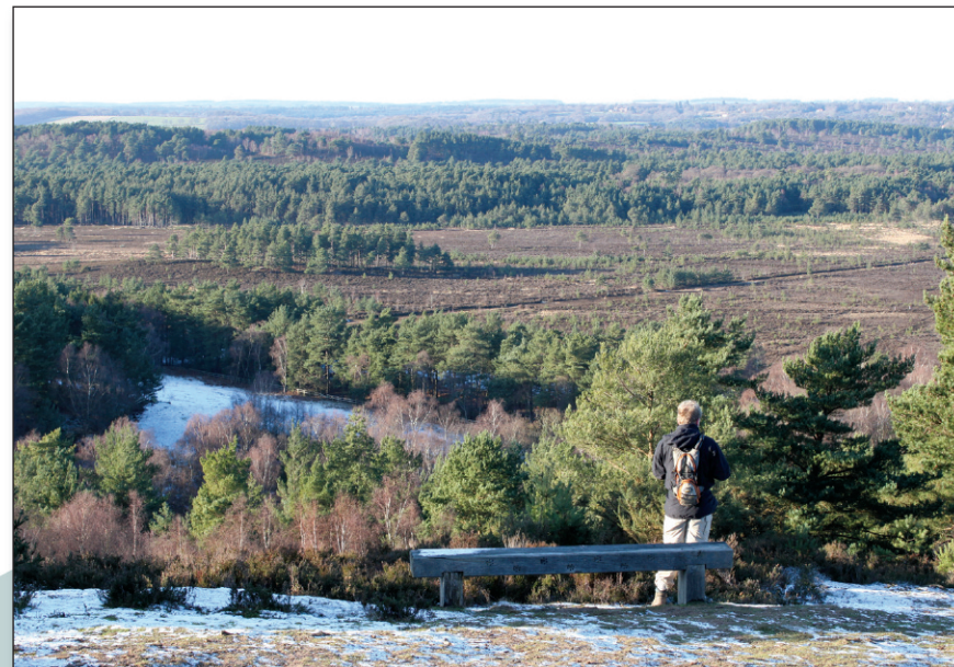
Looking out across 'The Flashes'