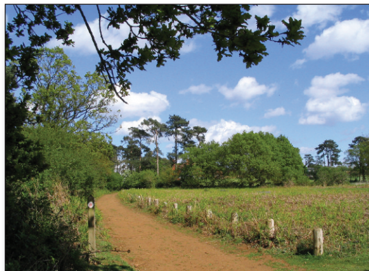
Section of the North Downs Way near Puttenham