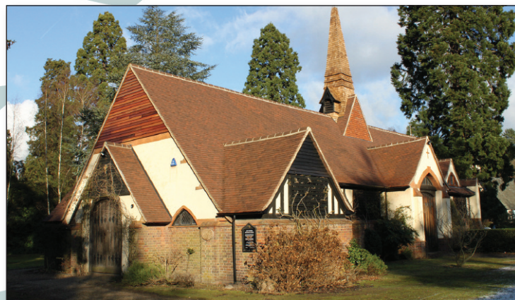
Right: St Edward's Orthodox church