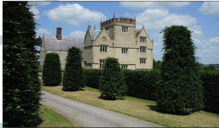
Right: South Fawley Manor.