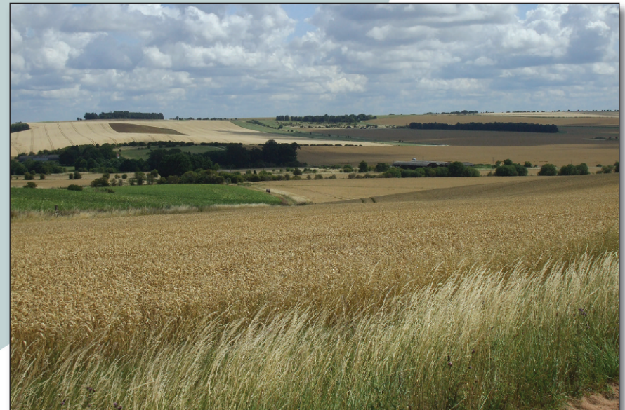
Looking down on Churn Farm and the bed of the disused railway.