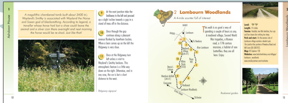
Example of a double-page spread.