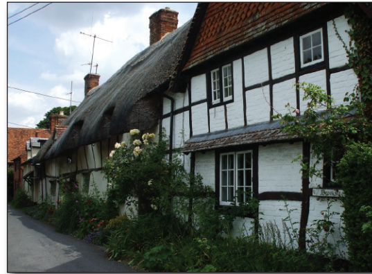
Cottages in Westbrook Street, Blewbury.