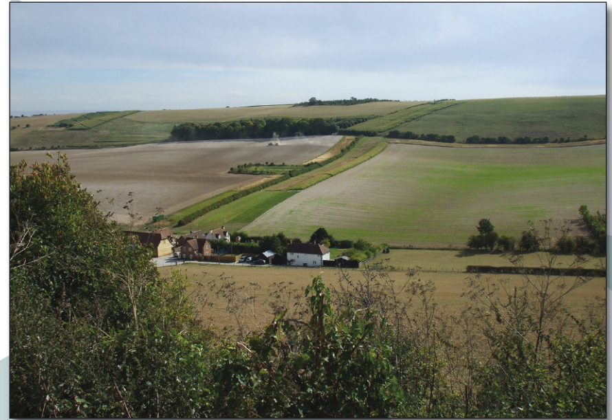
Starveall Farm from Kingstanding Hill.