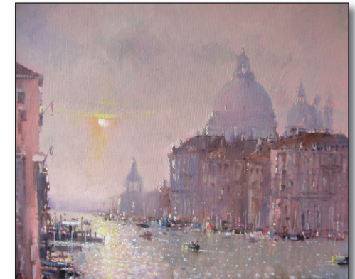
Grand Canal, Santa Maria Salute, Venice. Oil 16x20 inches