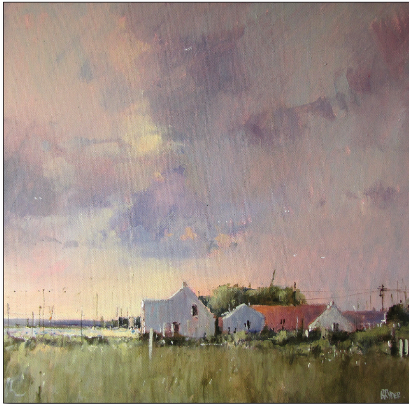
Brancaster Staithe II. Oil 16x16 inches