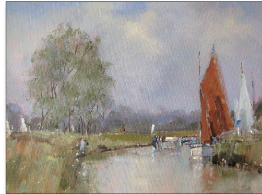
On the Broads, Ludham. Oil 7x9 inches