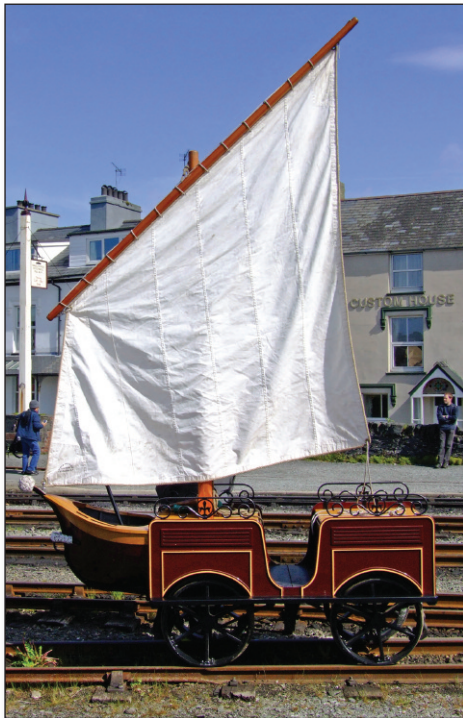
The modern-day replica of Charles Spooner's Festiniog Railway inspection saloon 'The Boat'.