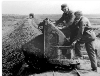
Spoil being tipped to build up the sea wall at Freiston Shore, as seen in the early 1970s.