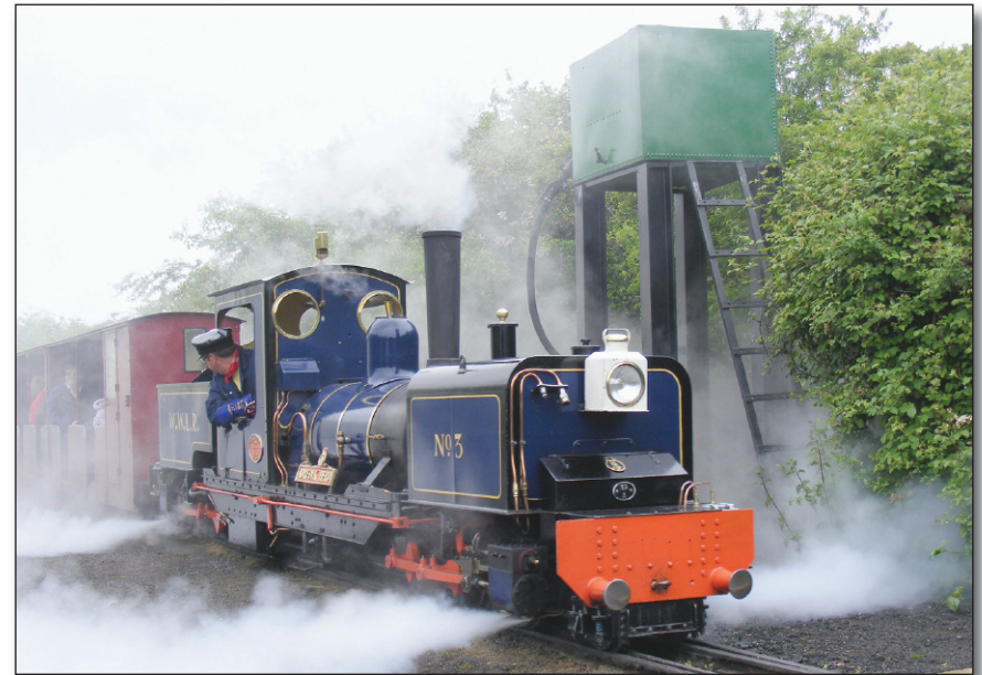
Norfolk Hero in steam at Walsingham station.