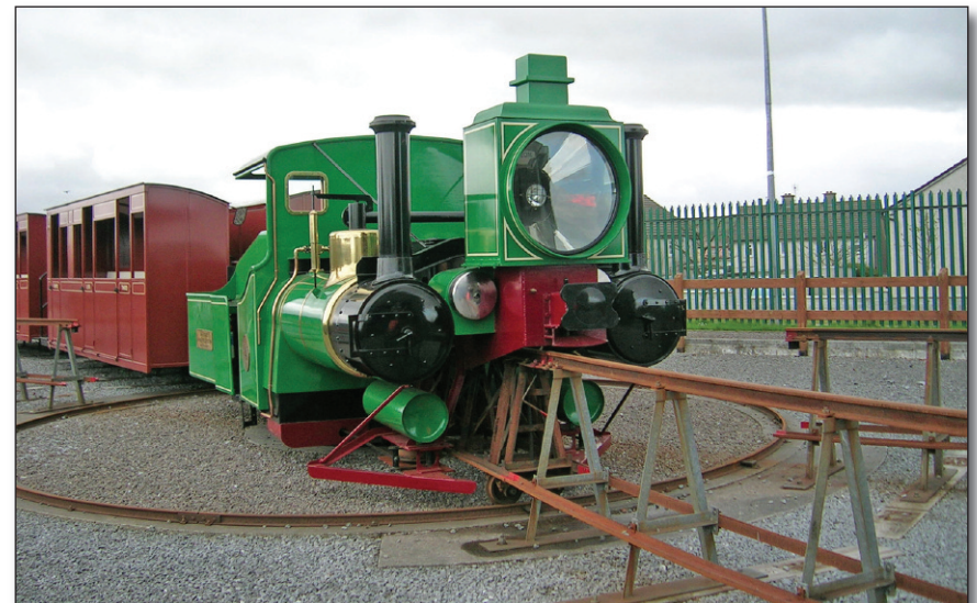
The replica steam outline Listowel & Ballybunion locomotive encounters one of the points. The train travels at 15mph while on the main line, approximately the same speed as the originals.