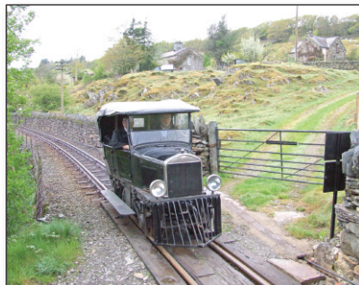
Adrian Shooter's Model T Ford at Rhiw Goch farm crossing on the Ffestiniog Railway in May 2010.