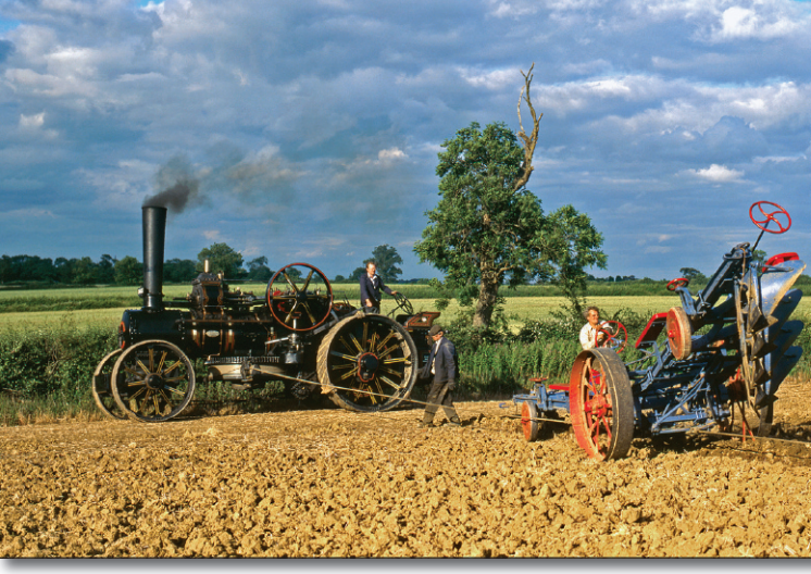
On a beautiful summer afternoon in rural Warwickshire, Fowler AA7 Ploughing Engine No I 5257 built in 1918 simmers as the four furrow balance plough sets off across the field winched by the second ploughing engine.

Above: 'Sister Wendy', 1931 Ransomes, Sims & Jeffries Traction Engine No. 42013 effortlessly surmounts 'Engine Hill' at Porthtowan in Cornwall.