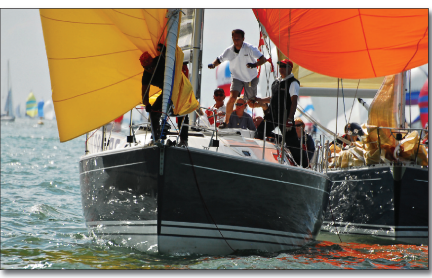
Class I racing in very light winds can lead to very tight finishes with dozens of boats jostling for position and flying every inch of sail they carry.