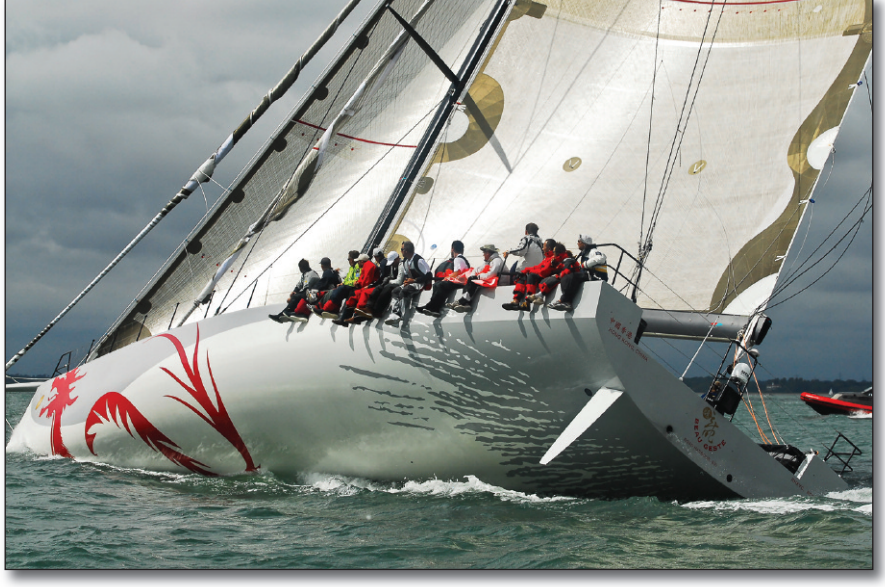
Beau Geste HK, a Class Zero racing yacht at Cowes, the largest of the Class Zero boats competing in 2009.