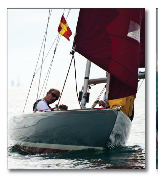
Above: The beautiful and distinctive Redwing is the oldest competitive sailing fleet in the UK.

Above right: The XOD class have been racing in the Solent area since 1911.