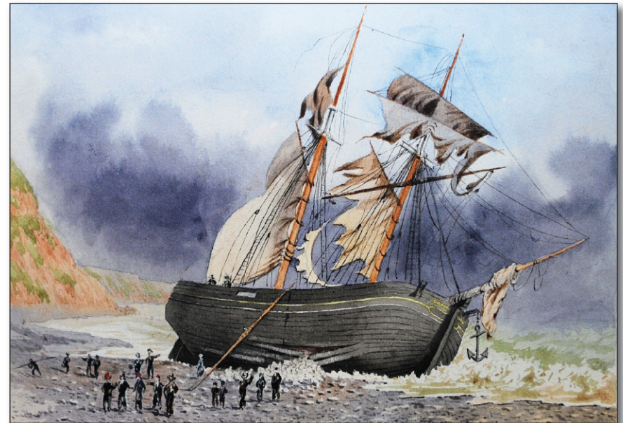
Schooner 'Sarah', laden with pipe clay, driven on shore a mile east of Sidmouth, Oct. 15, 1877.