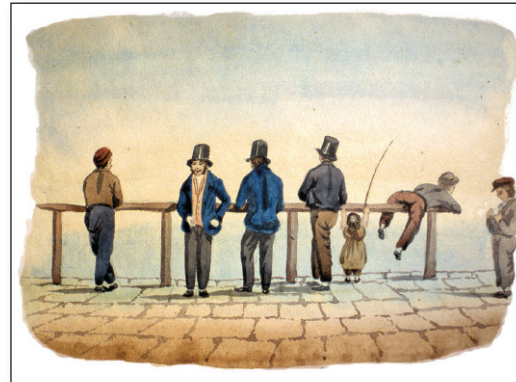
Above: Dartmouth Quay. October 2, 1847.