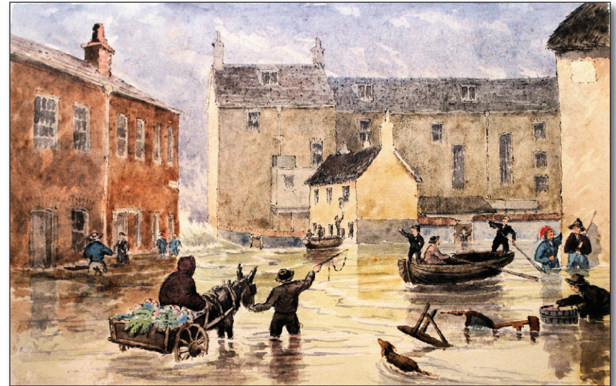
The sea, Westerntown, behind Marine Place. Dec. 4. 1876.