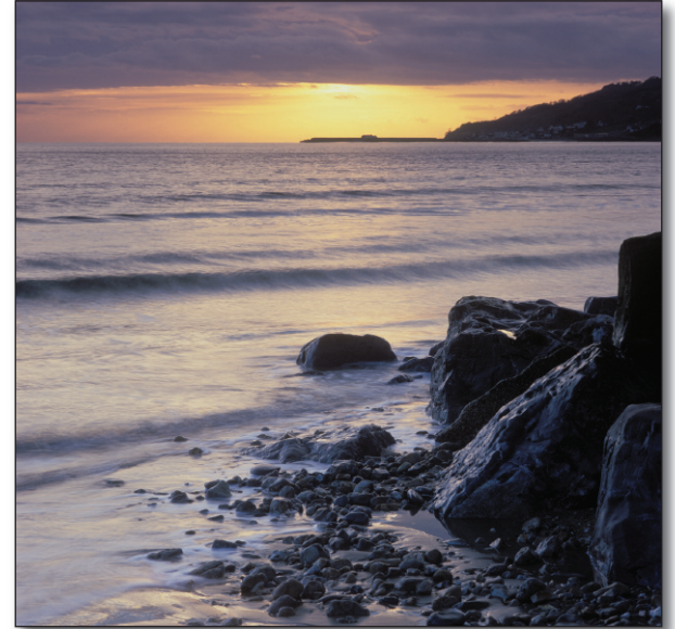
Charmouth to Lyme.