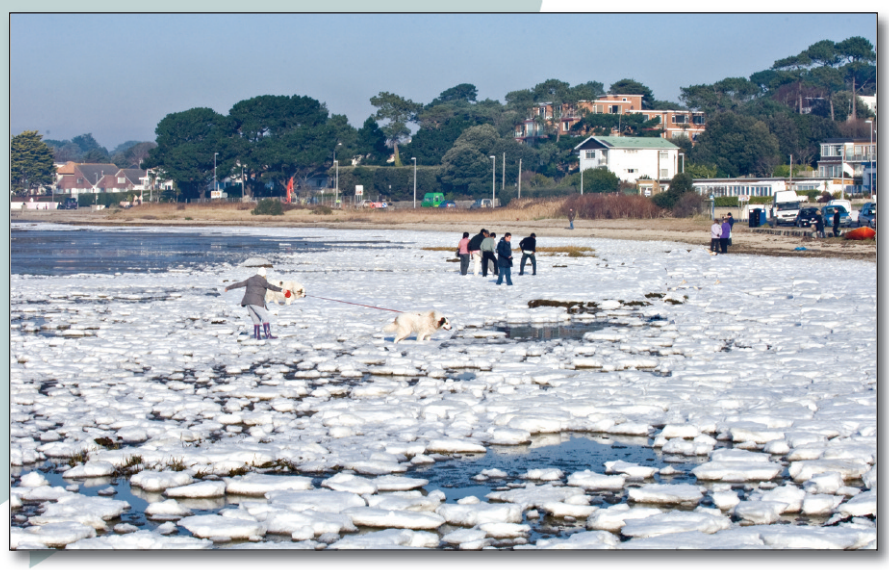
It is very infrequently that the temperature drops and stays low enough for the water on the shoreline of Poole Harbour to freeze as it did in 2009/10. On thawing, it produced these little ice-floes.