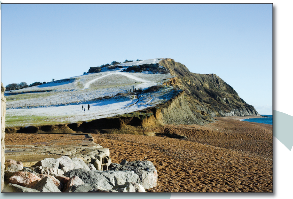
Golden Cap from Seatown looking east.