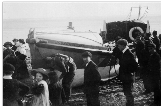
Above: Recovering the Joseph Somes ON41.