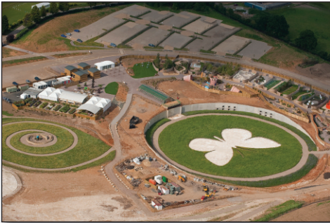
Left: Butterfly World, Chiswell Green, near St Albans.