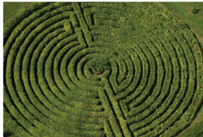
Above: Maze, Greenley. Not attached to a large house or open to the public it seems. Overleaf: Grand Union Canal, Rickmansworth, Hertfordshire.