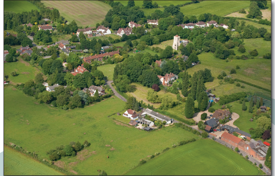
Arch Road, Great Wymondley.