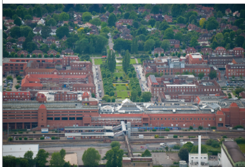
Welwyn Garden City railway station and gardens at Howards Gate.