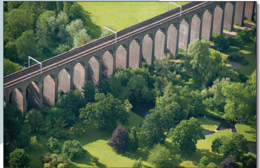
The Welwyn Viaduct, also called Digsweil Viaduct, carries the East Coast Main Line over the River Mimram.