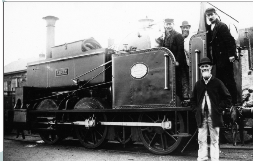
'MINER' is alongside the workshop at Devoran sometime in the early 1900s. This engine started life as an 0-4-OST in 1854. It was converted to an 0-4-2ST in 1855 and in 1869 it was again rebuilt as an 0-6-OST.

Industrial & Narrow Gauge Railways – Cornwall