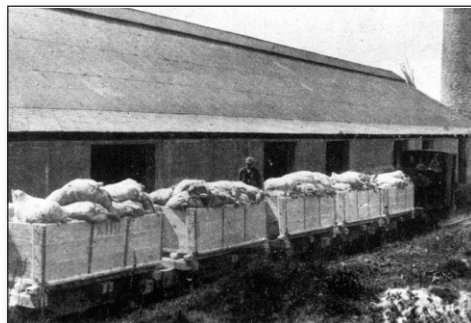
Above: In the early 1930s a train loaded with clay in jute sacks hauled by 0-4-OST HE 1428/1922 awaits departure from the kilns.