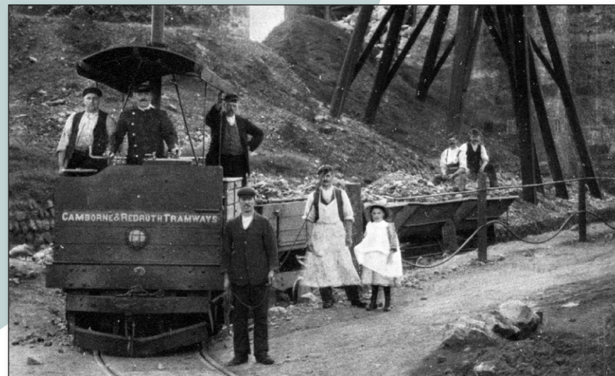
4wWE No.2 built by BTH in 1903 waits to depart from East Pool mine with a train of tin ore for Tolvaddon Smelting works about 1904.