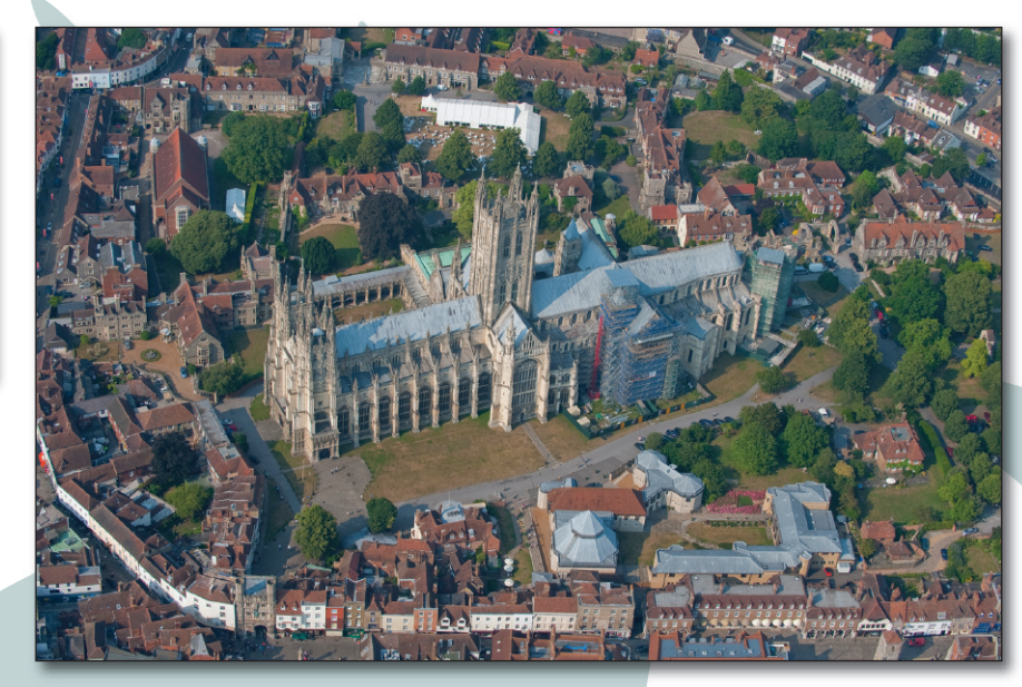
Canterbury Cathedral is Europe's longest medieval church.