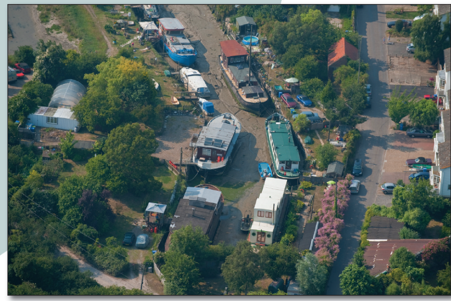
Conyer Creek in the village of Conyer, a characteristic North Kent marshland village, in the borough of Swale.