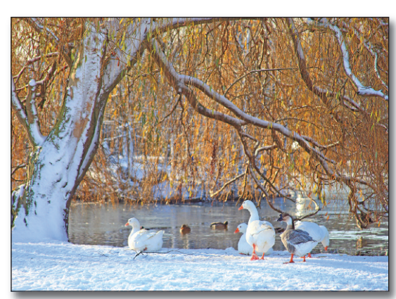
The sun filters through the golden willows on to the geese waiting patiently for food by Broadditch Pond.