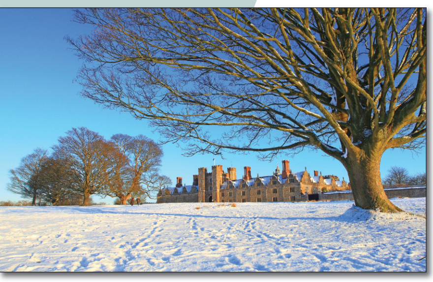
Knole House, Sevenoaks is managed by the National Trust. It was built by Thomas Bourchier, Archbishop of Canterbury and dates from 1456.