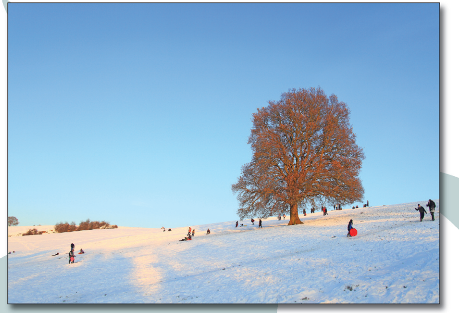
Time to dust off the sledges and snowboards for the chance to enjoy the winter sports at Castle Hill, not too far from Horsmonden.