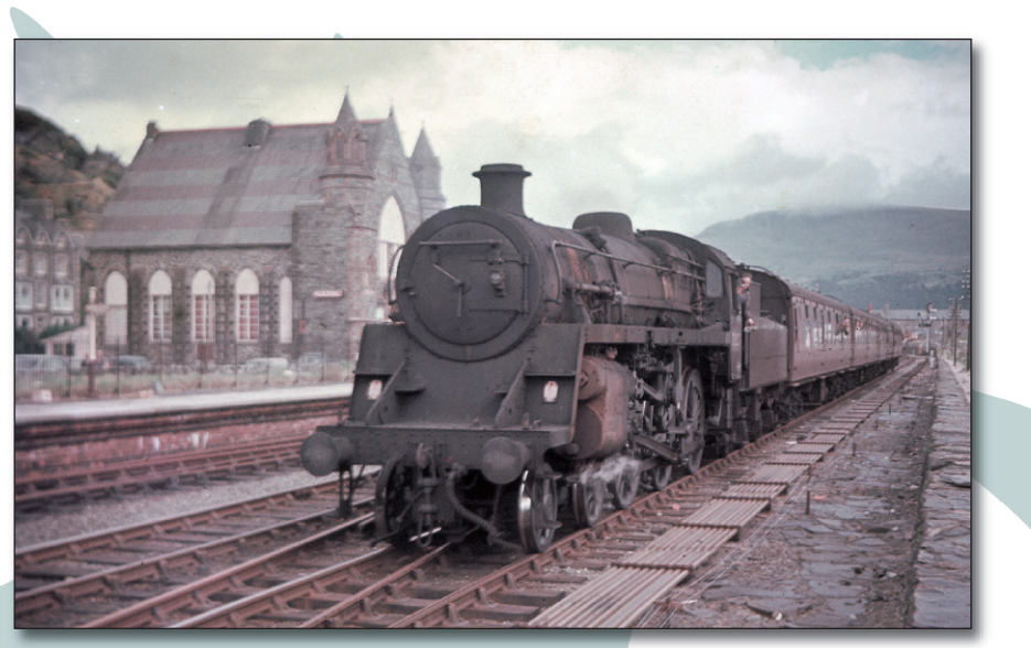
Minus its smokebox number plate, BR Standard Class 4 No 75055 heads the up Cambrian Coast Express into Barmouth. The impressive Cadair Idris rises majestically in the background. (29 July 1966)