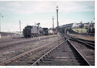
ex-LMS Black First wate at the scale of Helphard Matter Power Dayst is the company of an uncertainte of tracks. The held area bell rearly a classe stress factors for yours all Black Power, with the exception of Bestavoir Class Pacific No. 7001.3 'Weat's which was tracked totale the shell. (4 August 1966)