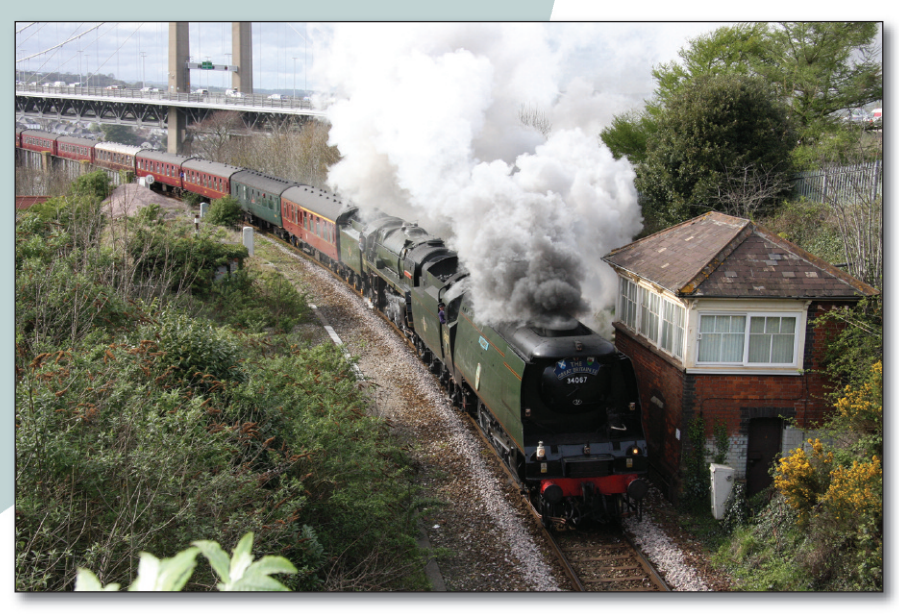
Making a fine smokey entrance to Devon, having just crossed the Tamar on Brunel's Royal Albert Bridge, is ex-SR Pacific No 34067 'Tangmere' piloting BR Pacific No 70013 'Oliver Cromwell'.