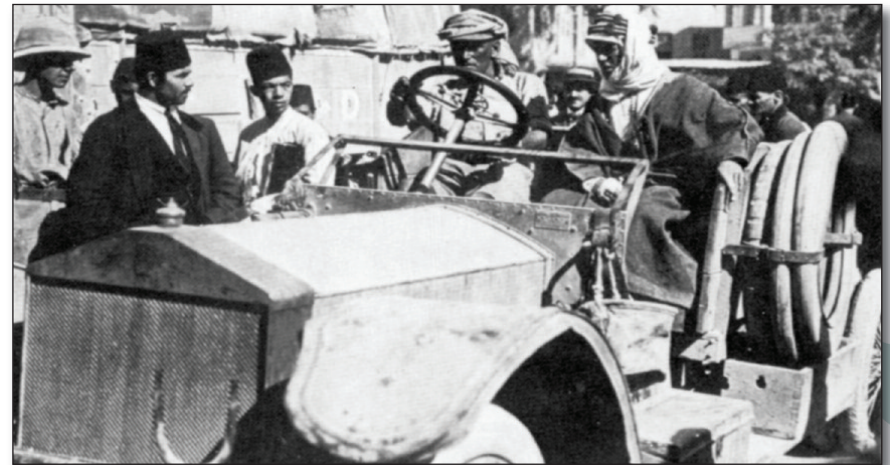
Lawrence at the front of a Rolls-Royce tender, at the head of the Arab Army, entering Damascus on 1 October 1918.