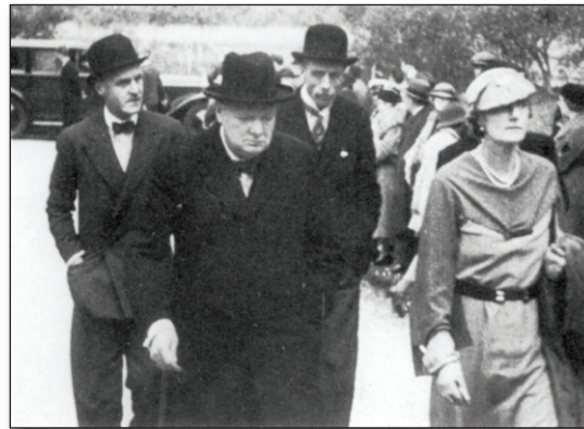
Winston Churchill and wife Clementine walking up the drive to St Nicholas Church, Moreton, for Lawrence's funeral.