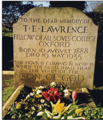
Lawrence's gravestone in Moreton Cemetery.