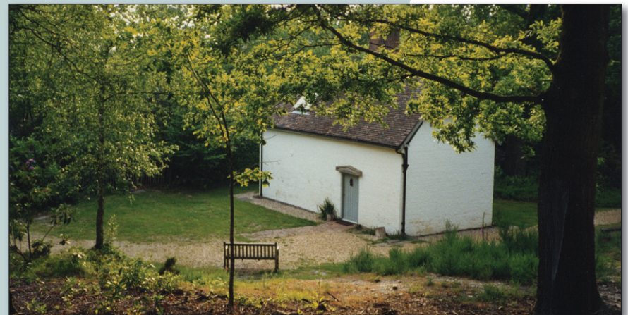
Clouds Hill cottage from the hillside.