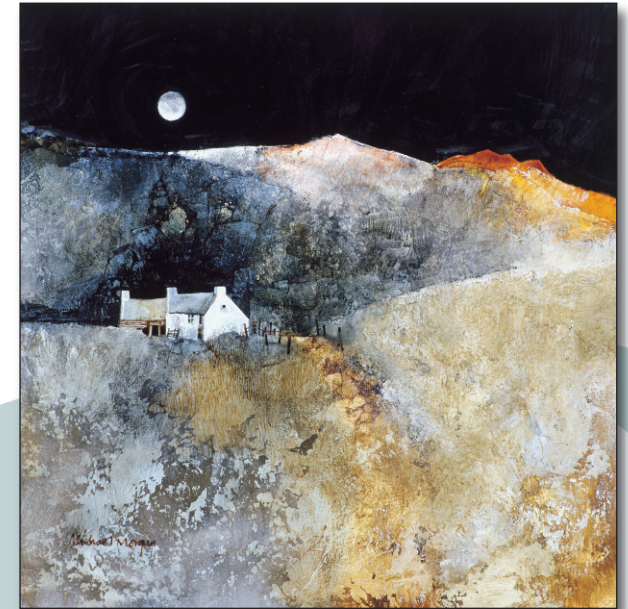
Rock Cottage 8.5 x 8.5in