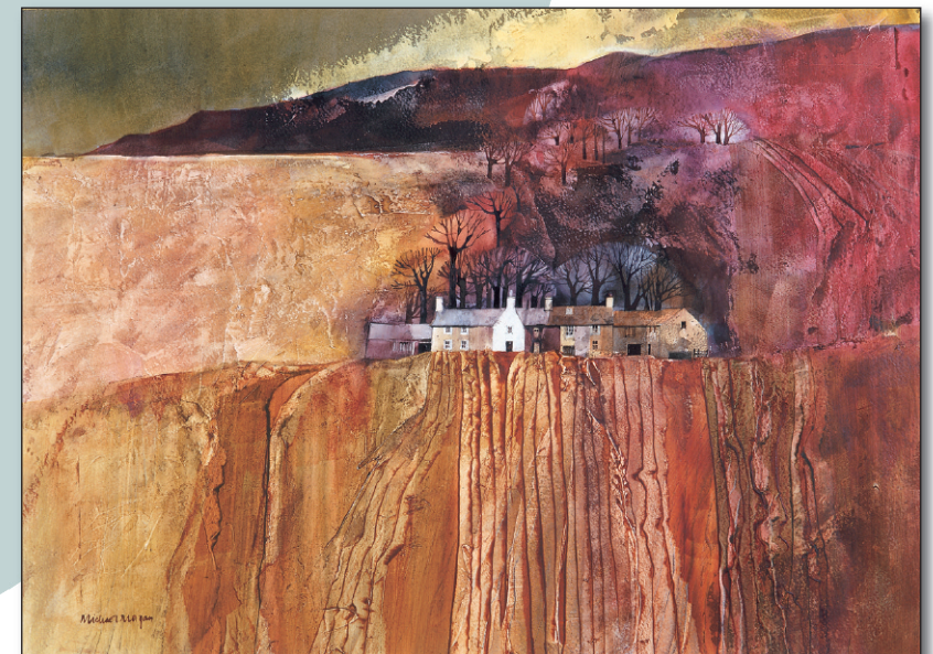
Autumn Morning 15 x 21in