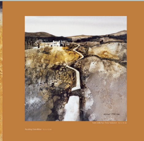
Example of a double-page spread.