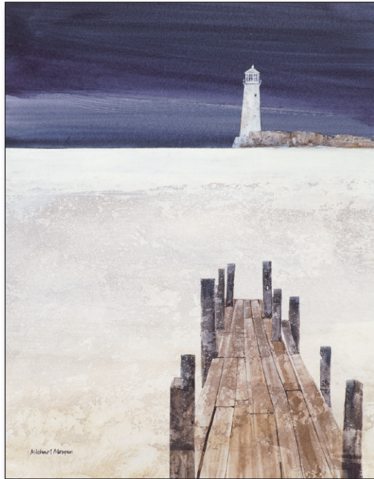
The Lighthouse 18.5 x 14.5in