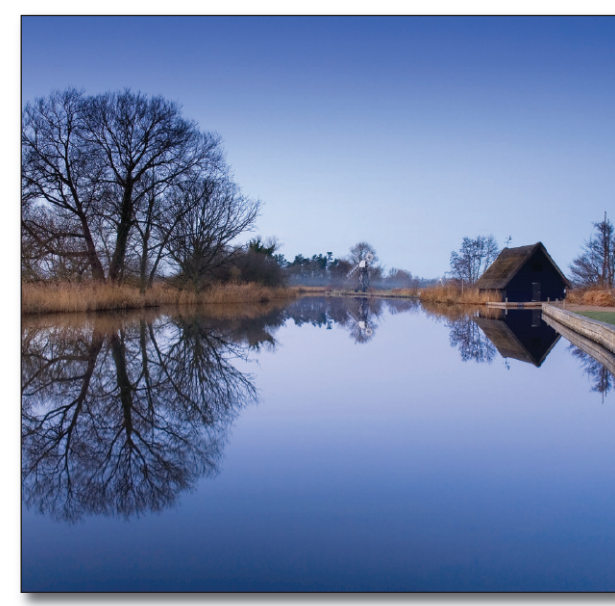
River Ant at Howe Hill.