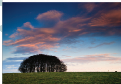
Above: The beach dump on top of Wilt Green Hill is a well-known local landmark.