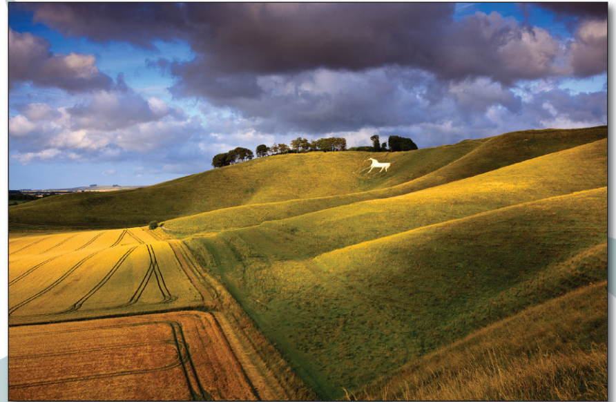
The Cherhill white horse. Cut in 1780, it is the second oldest of the Wiltshire white horses.