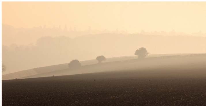
Right: A misty dawn at Cranborne Chase. The chalk plateau covers around 380 square miles, including Wiltshire, Hampshire and Dorset, and has been designated an Area of Outstanding Natural Beauty.