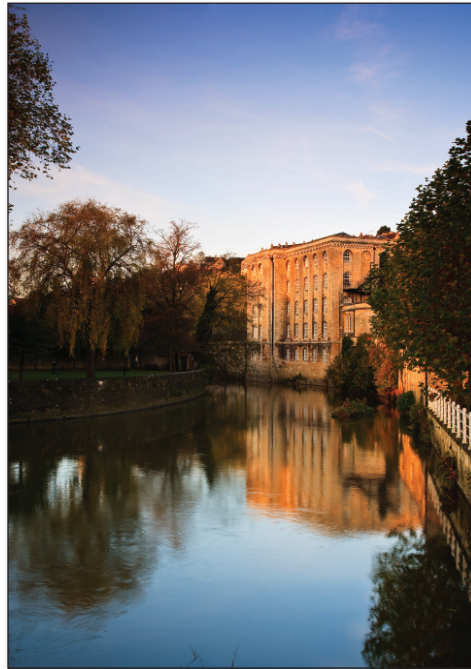
The Bath stone of Bradford-on-Avon, glowing in the early morning sun.