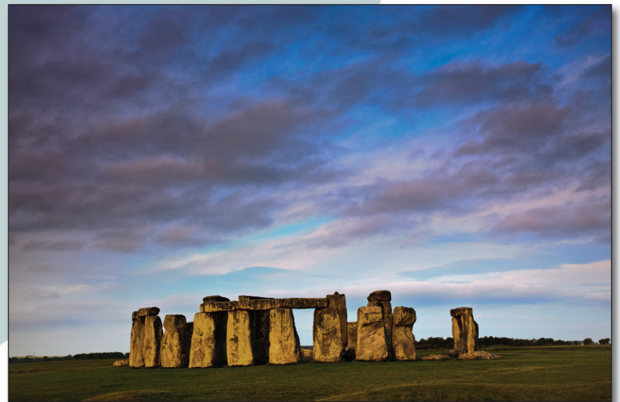
One of the most important prehistoric sites in Europe, if not the world, Stonehenge is an impressive sight.