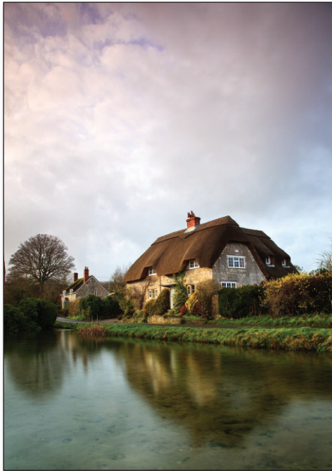
A quintessential English village, Sherrington is in an ideal spot next to a large duckpond.