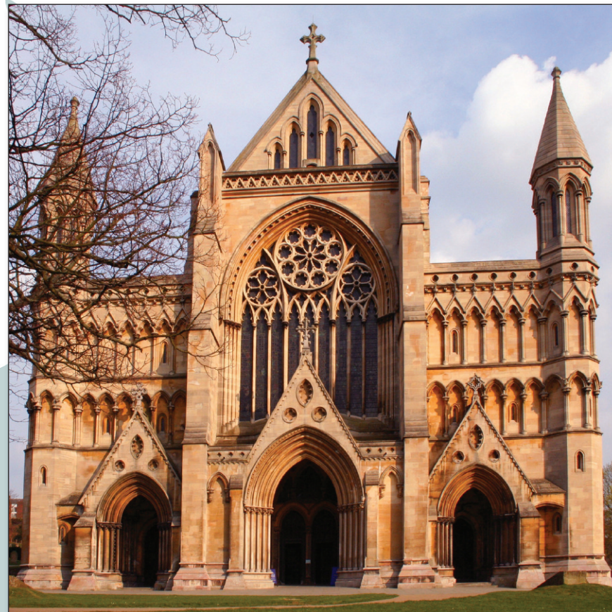
The striking west front of the Cathedral, restored by Grimthorpe in the nineteenth century, is one of the iconic images of the town.