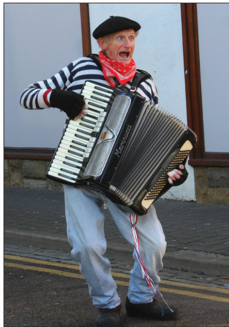
This busker has been a familiar figure on market days for many years.