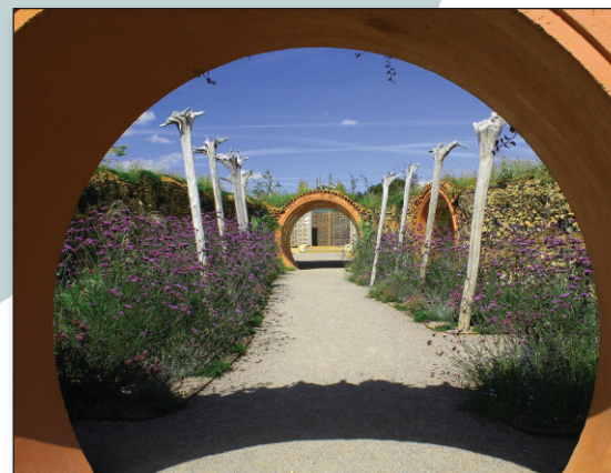
A dramatic view of one of the Future Gardens at Chiswell Green.