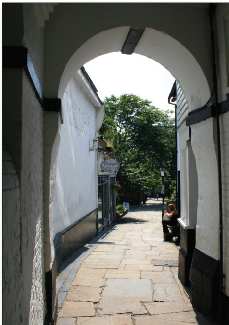
Waxhouse Gate, which gets its name from the candles sold to pilgrims, leads down from the High Street to the Cathedral.