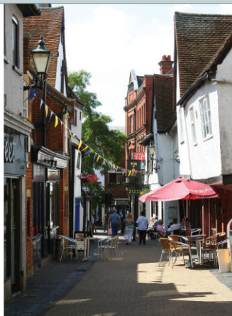
French Row, possibly named from the French prisoners once kept there, is one of St Albans' best known side streets.