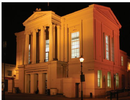
The old Town Hall by night. The building now hosts a restaurant, the Tourist Office and the restored courtyard.