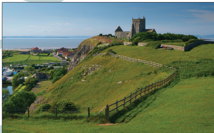
Right: Uphill Cliff and the old church of St Nicholas with Uphill Marina below, looking out across Weston Bay.