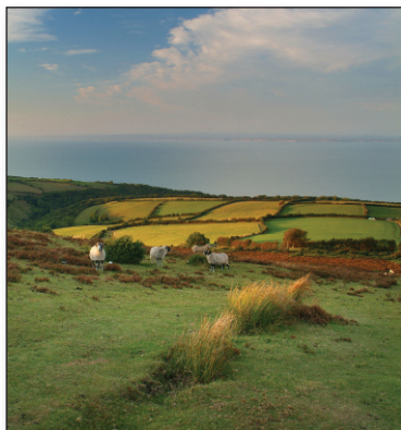
Sheep grazing on Porlock Common.