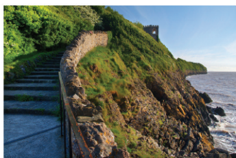
Part of Wall, a cliff path over Church Hill and House Hill at Clevedon with St Nicholas' Church on the cliff edge.