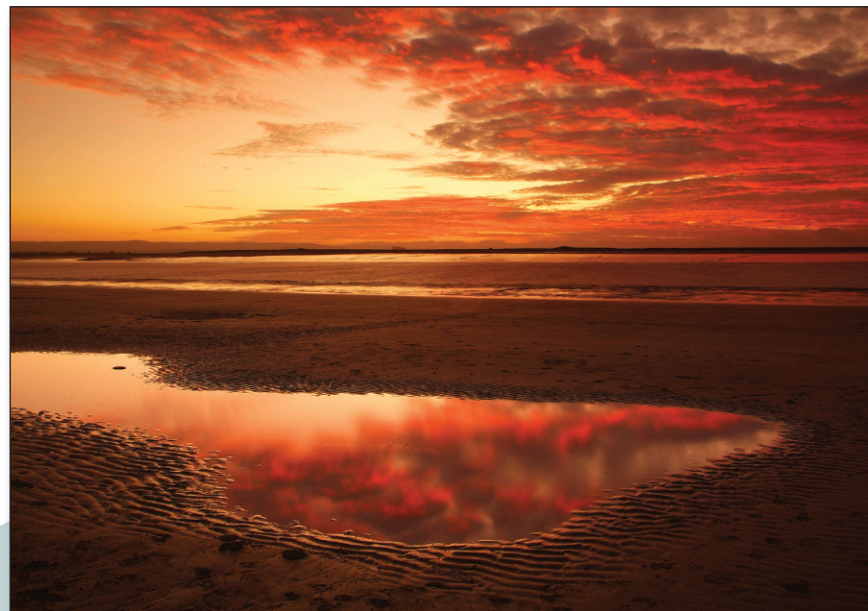
Beach and sunset at Burnham on Sea, looking towards Steart Island and across Bridgwater Bay.