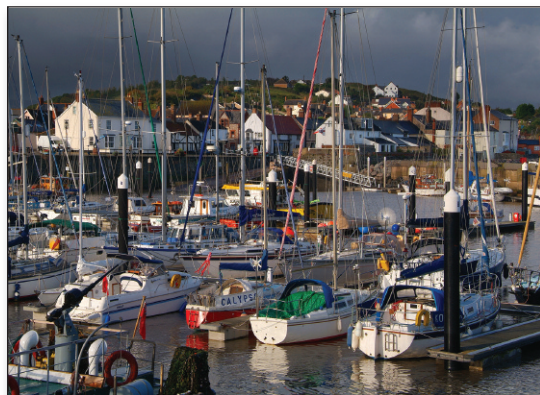
The harbour at Watchet with an approaching storm behind.