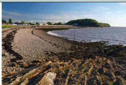
Looking towards Church Hill across Salthouse Bay, Clevedon.