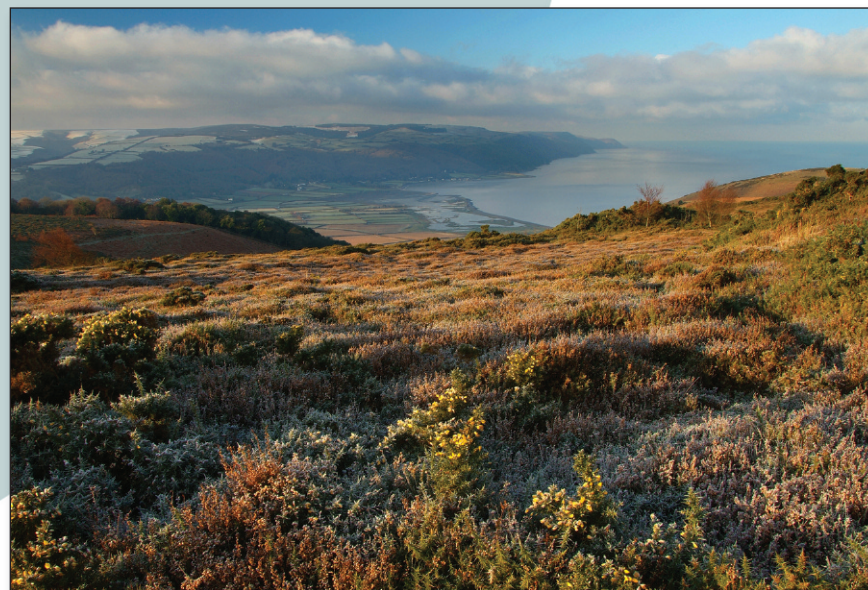
Frost on the gorse of Bossington Hill with Porlock Common and the sweep of Exmoor in the distance.