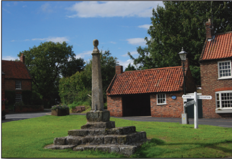
The village green at Lund has a market cross which indicates that it once hosted a weekly market.