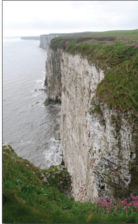
Bampton Cliffs. The chalk Wolds form spectacular vertical cliffs where they meet the sea.