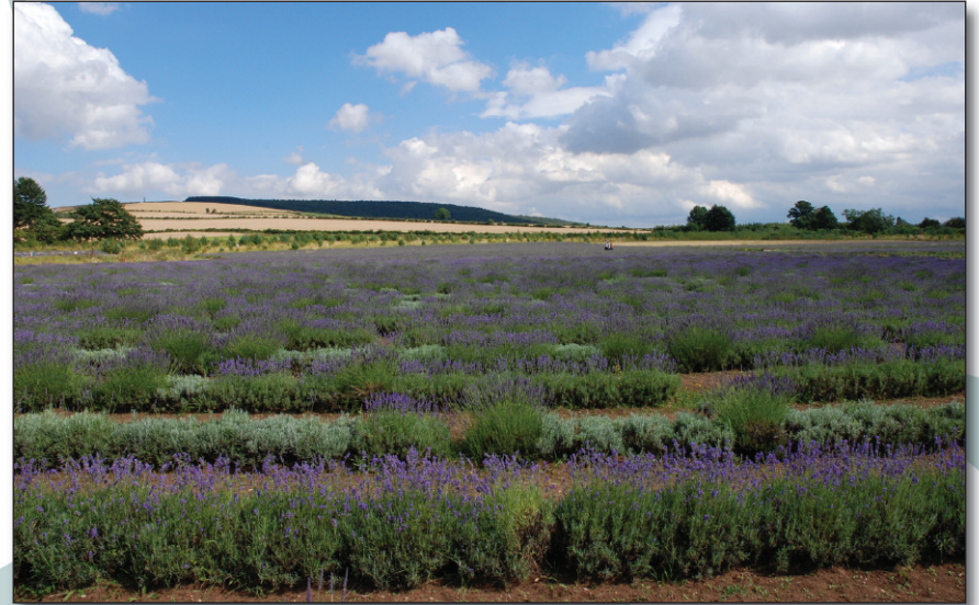
The Wolds Way passes close to the lavender farm and distillery at Wintringham.