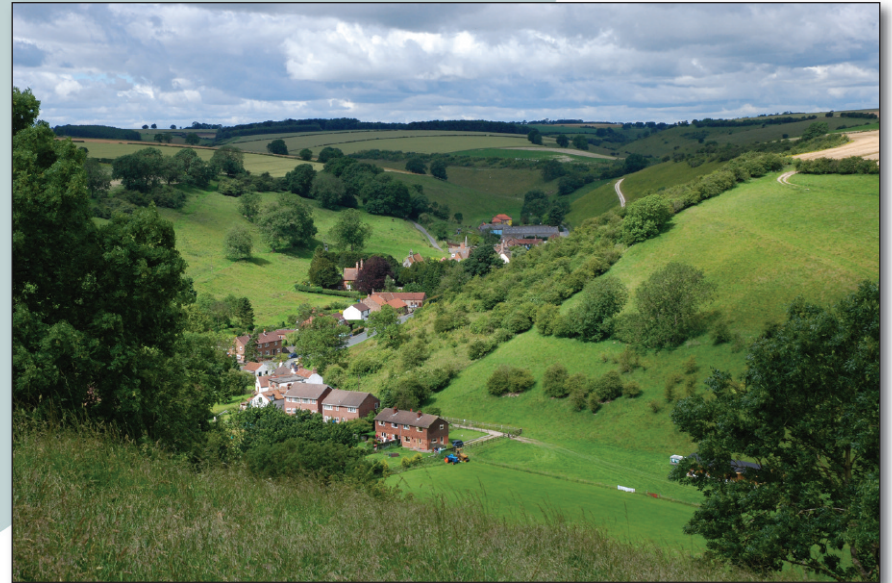
Thixendale. The isolated village lies at the bottom of a steep-sided dry valley.