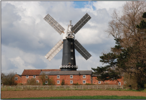
Skidby Windmill. Built in 1821, this is the only windmill in working order in the East Riding.