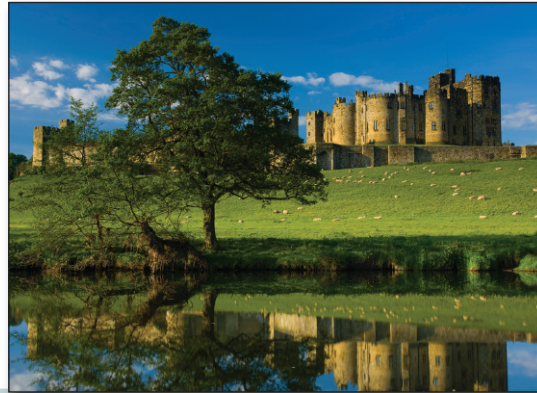
Alnwick Castle, often referred to as 'The Windsor of the North', reflected in the still waters of the River Aln.