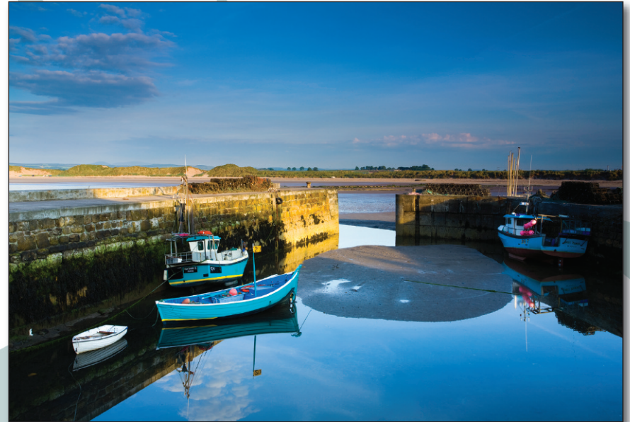
Boats moored within the harbour walls of Beadnell Harbour.