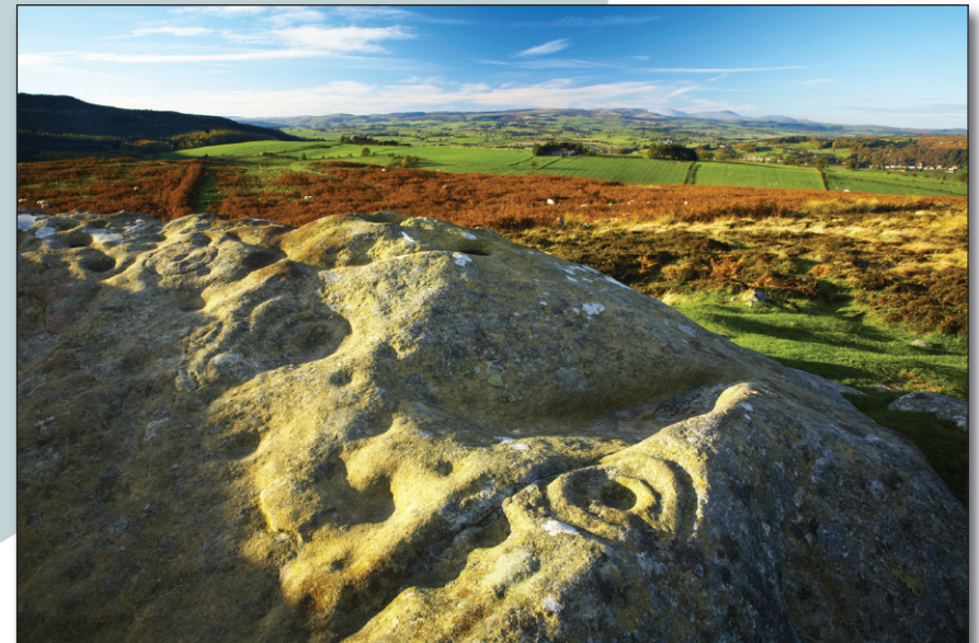
Prehistoric cup and ring marks and rock art located on a stone at Lordenshaw near the Lordenshaw Hill Fort.