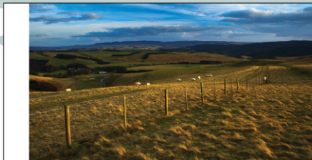
A wire fence running alongside the historic Clennell Steep route, as it heads towards Alwinton and the Coquetdale Valley.