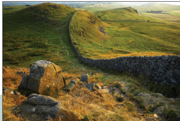
Right: Sunset behind the World Heritage Site of Hadrian's Wall near the town of Once Brewed.