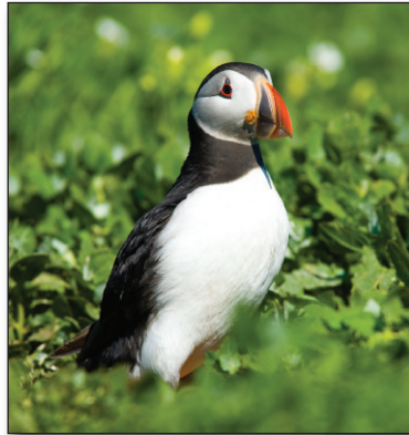
A single puffin waits patiently for its mate to return to their burrow on the Inner Farne Island.