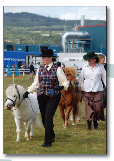
Smartly turned out handlers complement their charges.