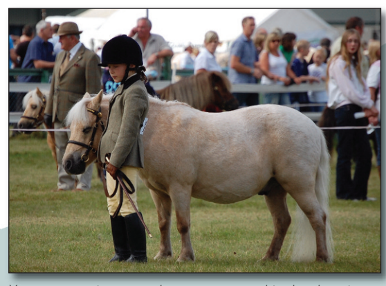
Young competitors are always encouraged in the showring.