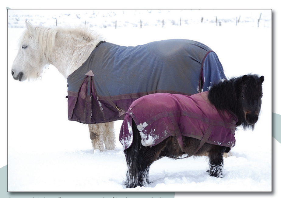
In several inches of snow a rug and a friend are good allies.