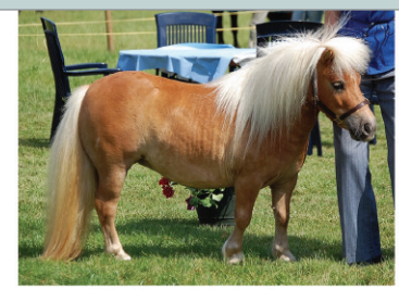
The breed throws some lovely colour combinations. Opposite page: The business of showing can turn into more of a gathering of friends.