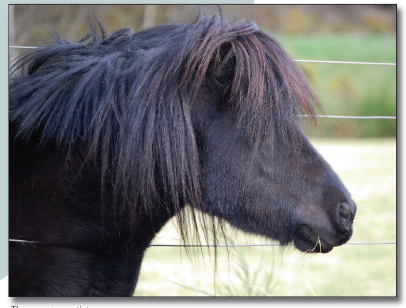
The escape artist.