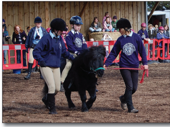
Sometimes ponies and riders need helpers as here at Newtonmore in the Highlands.