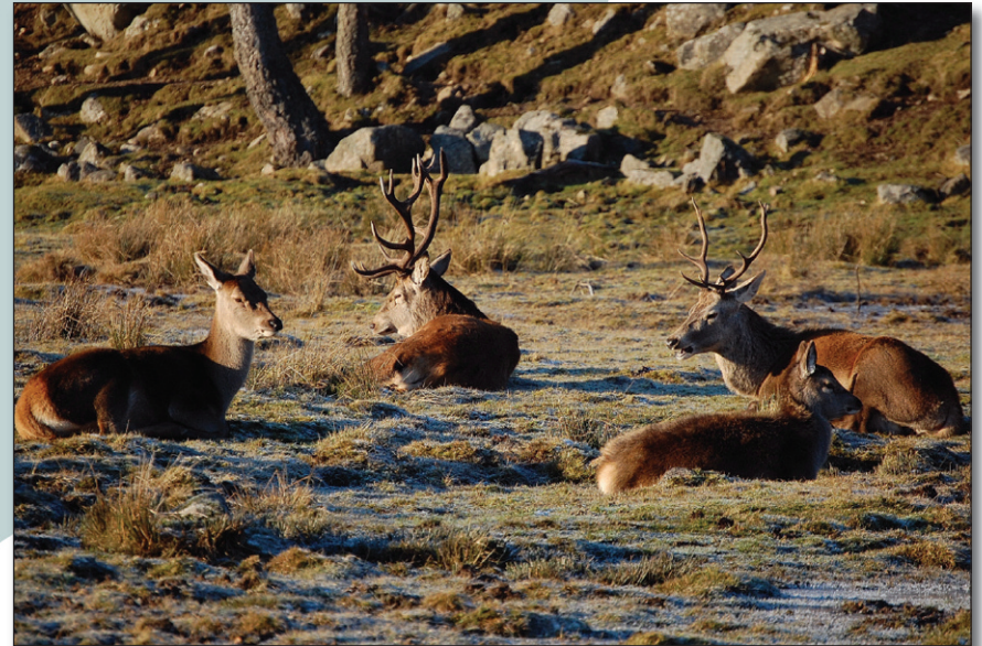
Red deer are often seen in the area. These sit in the winter sun at Kingussie at the Highland Wildlife Centre.