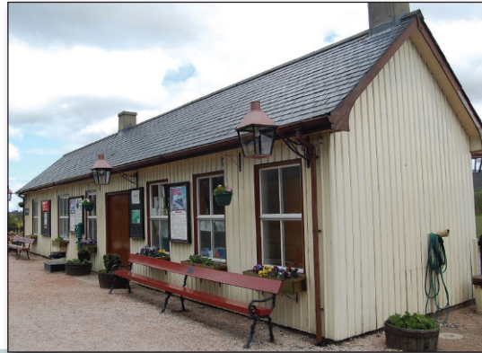
Broomhill Station where several scenes for the popular TV series 'Monarch of the Glen' were filmed.