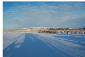
Ben Algon winter snow scene.