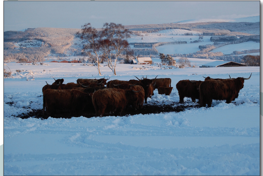
Highland cattle in the snow.