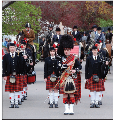
Dufftown Pipe Band piping a mounted cavalcade under the bridge by the Mash Tun public house in Aberlour.