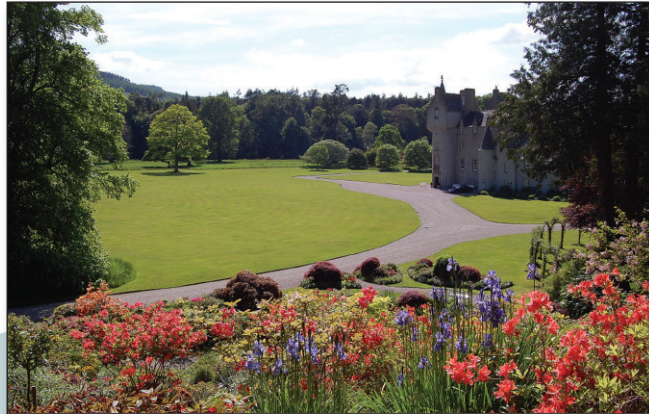
Right: Ballindalloch Castle photographed from the top of the stunning rock garden.