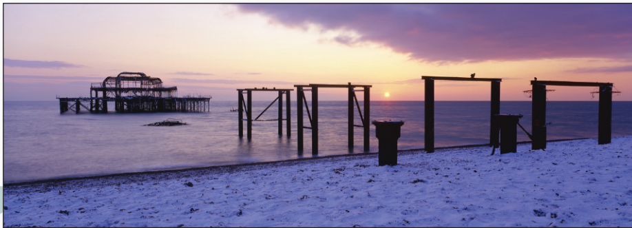
Brighton's West Pier in snow This scene of the much-photographed ruins of Brighton's West Pier is made unusual by a heavy snowfall over previous days, crowned by a wonderful winter sunset.