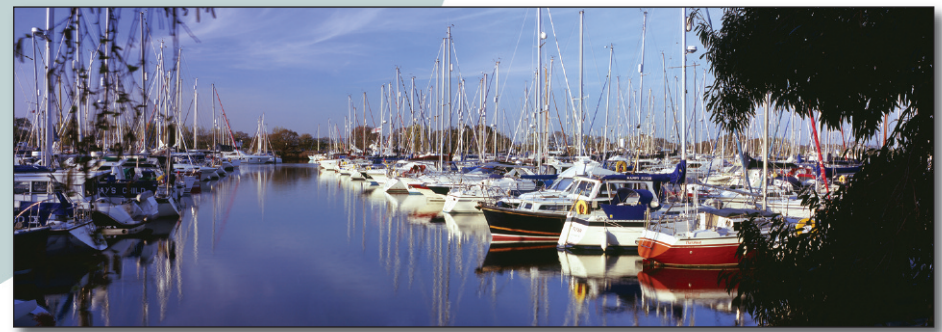
Still waters at Chichester marina Rows of moored yachts cast reflections on the still waters of Chichester marina on a clear spring evening, one of several marinas within the Chichester Harbour conservation area.