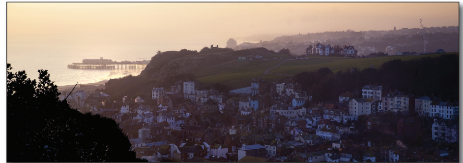
View over Hastings Old Town A hazy winter sunset turns the sky orange in this view over the rambling streets of Hastings Old Town, as seen from the town's East Hill. Hastings is one of the famous Cinque Ports on the English South Coast.