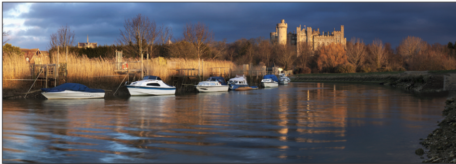
Golden Arundel Early morning sunlight bathes Arundel Castle in an orange glow, set against dark clouds in the background. In the foreground, gentle ripples on the River Arun create distorted reflections of this classic view of the Norman castle.