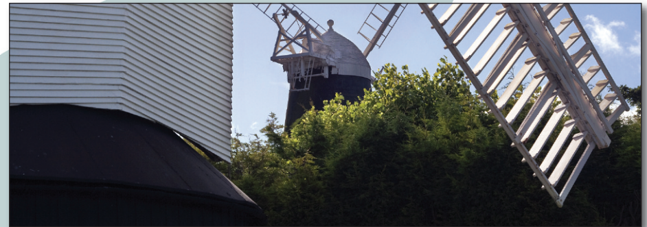
Jack or Jill? The Clayton Windmills, known locally as 'Jack' and 'Jill' (background and foreground, respectively), are set on the South Downs above the village of Clayton, and afford splendid northerly views across the Sussex Weald.