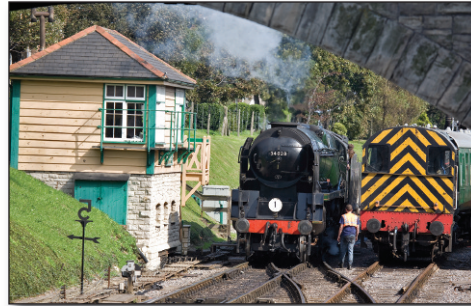
Bulleid Pacific No. 34028 "Eddystone" runs round at Swanage whilst the 08 diesel shunter station pilot waits in the bay with some coaching stock. 13th Sept 2008.