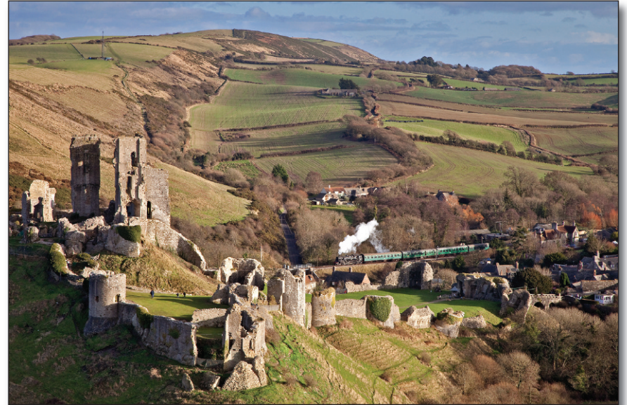
A wonderful view of the castle from West Hill with BR Standard tank No. 80104 leaving Corfe Castle Station on 27th December 2009.