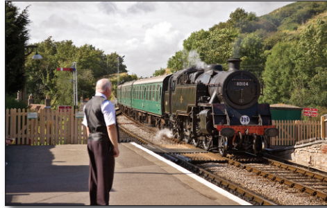
A member of the station staff watches as Standard tank No. 80104 arrives at Corfe Castle with a Swanage-bound train on 10th August 2008.