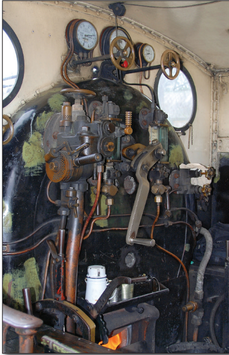
Cab detail of the M7. (AT)