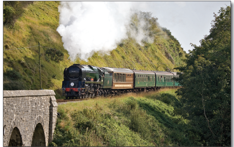
Rebuilt "West Country" No. 34028 "Eddystone" leaving Corfe Castle towards Norden with the Devon Belle observation car as the first vehicle in the train on 13th September 2008.