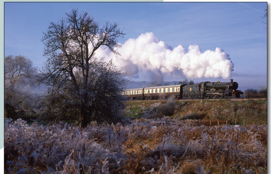
Frost is melting as 7903 "Foremarke Hall" takes the first train of the day northbound from Winchcombe to Toddington at Chicken Curve.