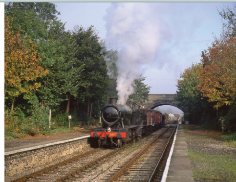
On a misty day with the sun breaking through, GWR Heavy Goods Engine no 2857 brings a freight train south from Broadway into Platform 1 at Toddington Station.