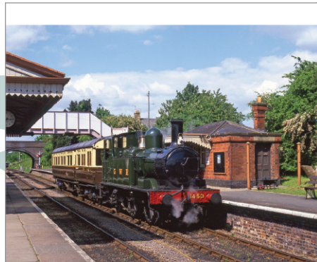
GWR 14XX no 1450 stands on Platform 2 at Toddington Station with its auto-railer coach awaiting the start of duty.