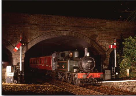
Above: GWR 14XX no 1450 stands at night underneath the B4077 roadbridge at the north end of Toddington Station.