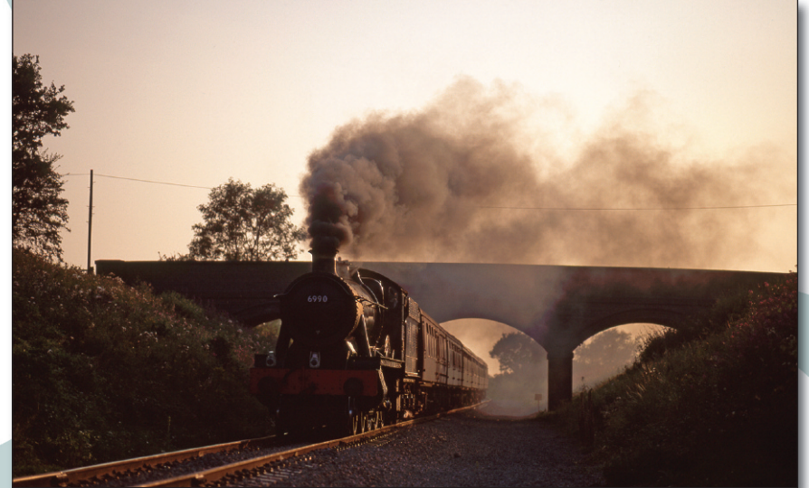
Picking up the last of the evening light, GWR Hall class no 6990 "Witherslack Hall" blasts through Dixon cutting northbound.