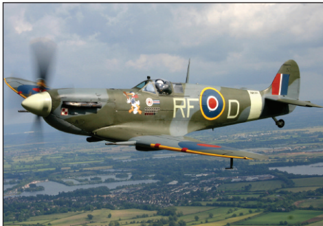
Spitfire Vb carrying WWII Polish Squadron insignia.