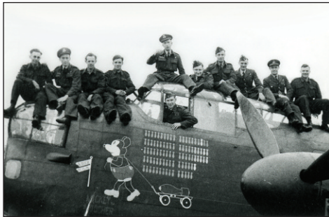
The crew of Lancaster 'Phantom of the Ruhr', 1943.