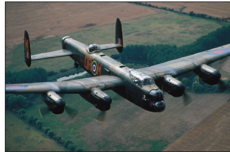
Battle of Britain Memorial Flight Lancaster 'City of Lincoln'.