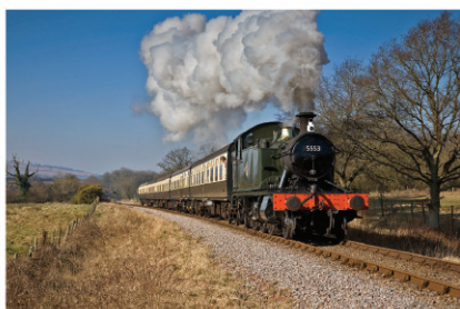
We start the book with a shot of Prairie No. 5553 propelling up the grade at Leigh Woods on 17 February 2008 with the 10.30 Minehead to Bishops Lydeard service. Very much a regular day-in-day-out scene in West Somerset in the early years of the twenty-first century!