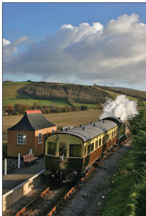
No passengers waiting so No. 5542 propels auto coach No. 178 through Doniford Halt with a Minehead-bound service on 28 December 2003.