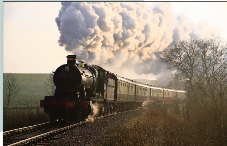
38xx 2-8-0 No. 3850 works a Santa Special towards Crowcombe on 28 December 2006.