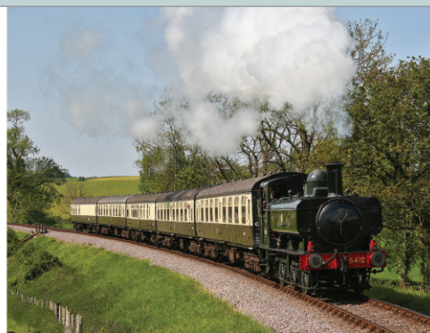
Long-corn WSR subunit Prairie No. 6412 working a direct experience special past Rickardley on 17 May 2005.