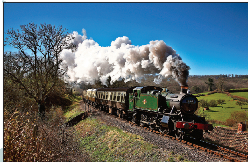
Large Prairie No. 4160 passing Nethercott on a clear and cold 21 March 2007 with the 10.25 Bishops Lydeard to Minehead service.