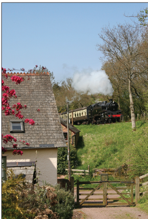
The spring flowers are blooming as BR Standard 4 tank No. 80136 passes Yarde Farm near Stogumber on a fine 29 April 2006.