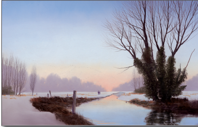
Early Winter Snow, Buxton.