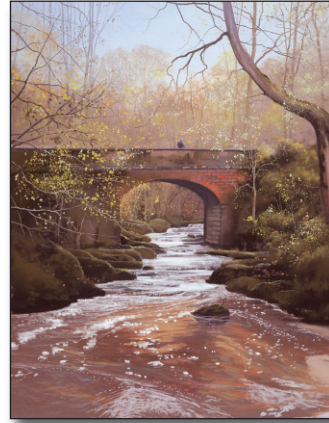
Tumbling Stream, Whitby.