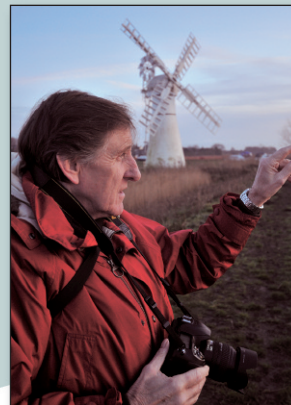
The artist seeking inspiration