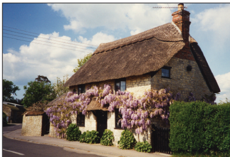
Wisteria at Fifehead