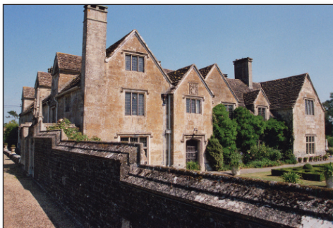
Hinton St Mary Manor House