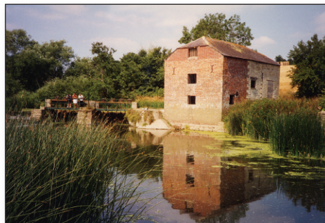
Cutt Mill idyll