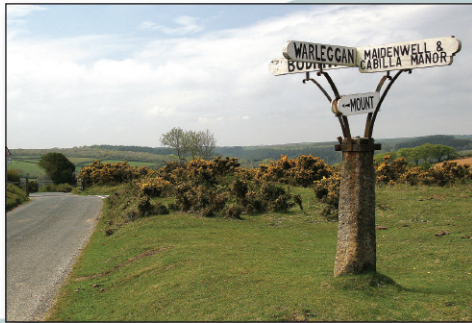
Moorland cross roads near Wareleggan