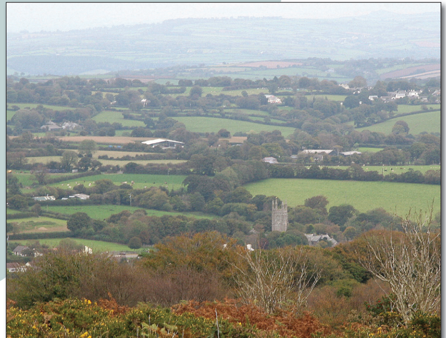
North Hill from Hawk's Tor