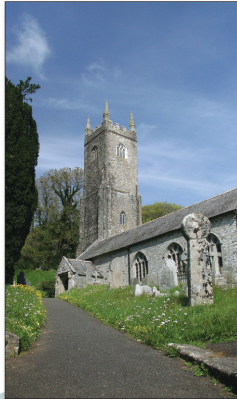
Altarnun church, known as the Cathedral of the Moor