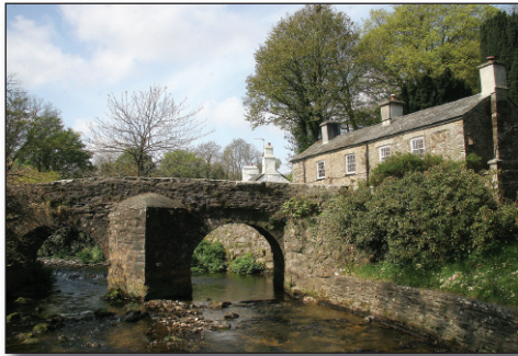
Medieval packhorse bridge, Altarnun