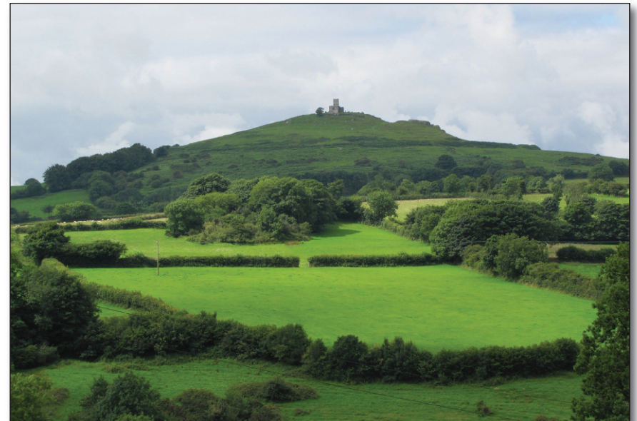
Brent Tor seen for miles around.