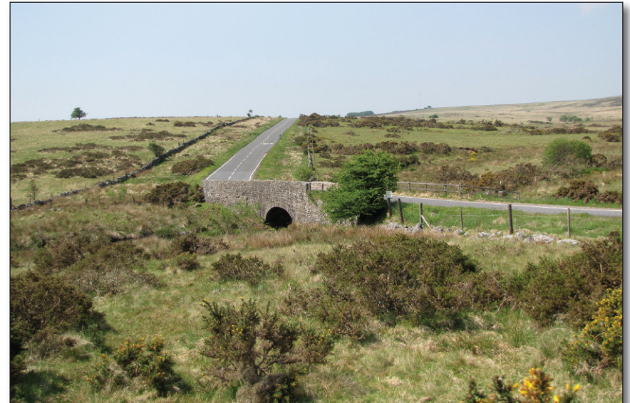
The Hairy Hands corner near Cherrybrook.